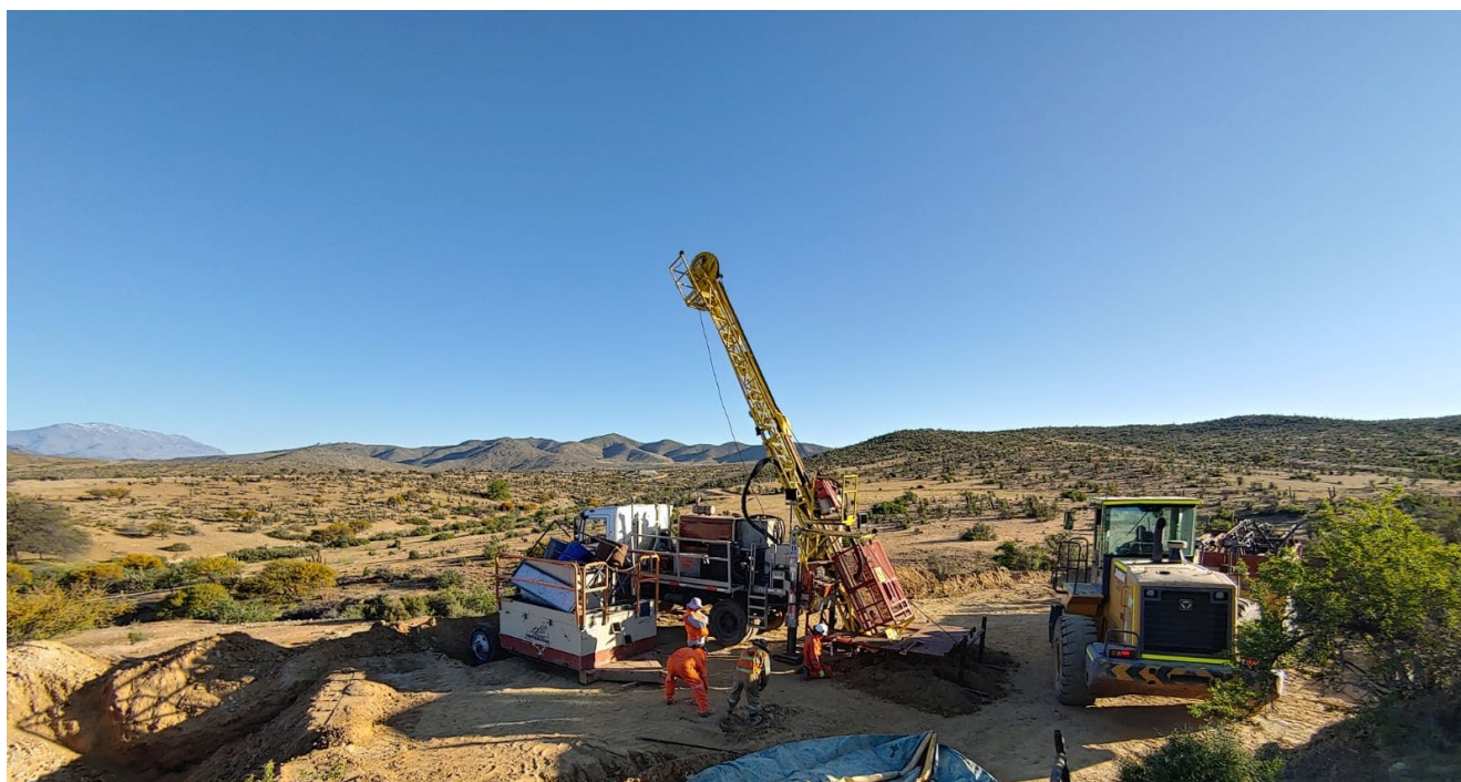
Figure 1: Drilling rig onsite at the Lana Corina Project, Phase 2 Drilling.