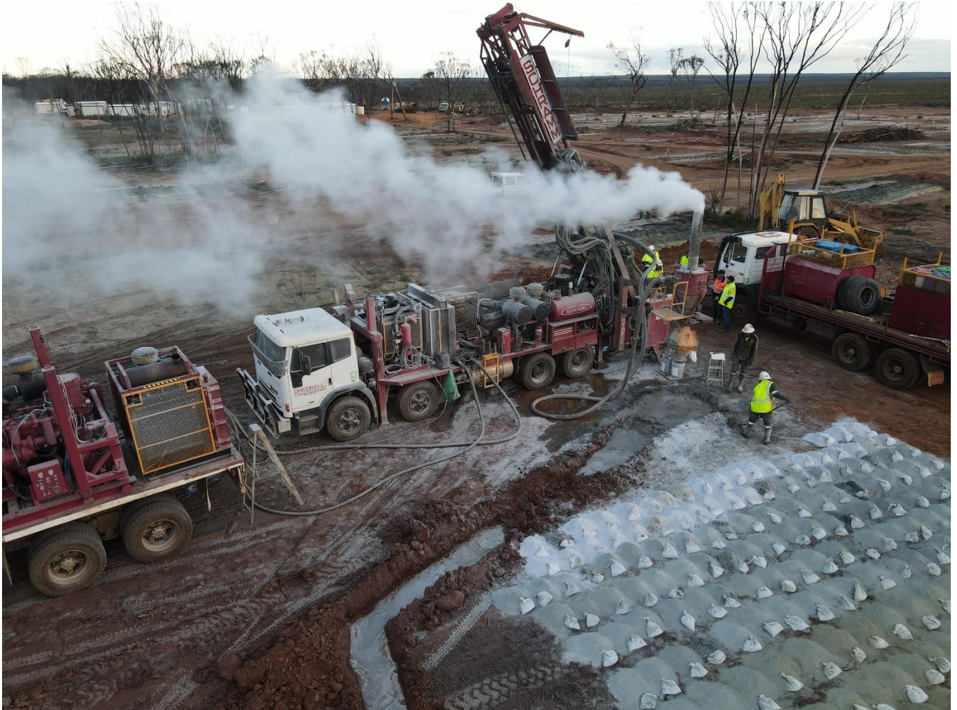
Figure 4: RC Drilling at Kat Gap