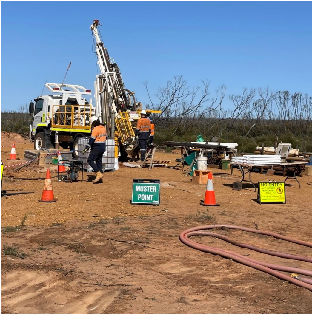
Figure 2: Diamond Drilling Rig at Kat Gap

The overall infill RC drilling program consisted of 109 holes for 7,110. Currently 85 holes for 5,085m have been completed to date. The remaining holes in the program should be completed in the next couple of weeks. Assay results will be released to the market as they become available.