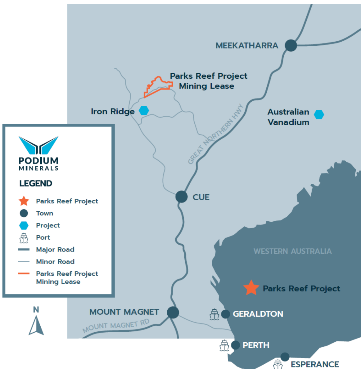
Figure 2. Location of the Parks Reef PGM Project 80km West of Meekatharra in Western Australia.

A successful and highly motivated technical and development team is accelerating Podium's strategy to prove and develop a high-value, long-life Australian PGM asset.