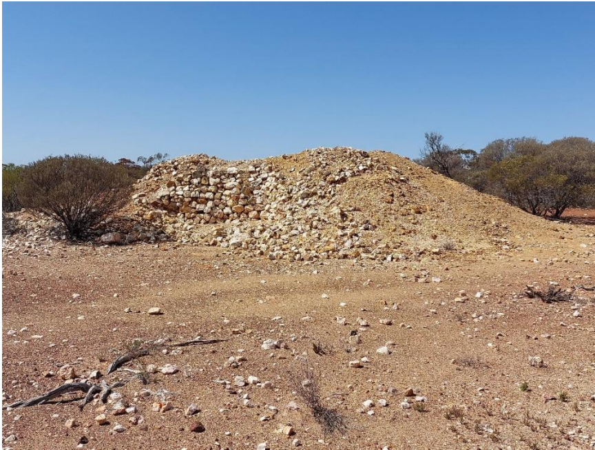
Figure 2: Historical workings observed during the program at Niagara West tenements