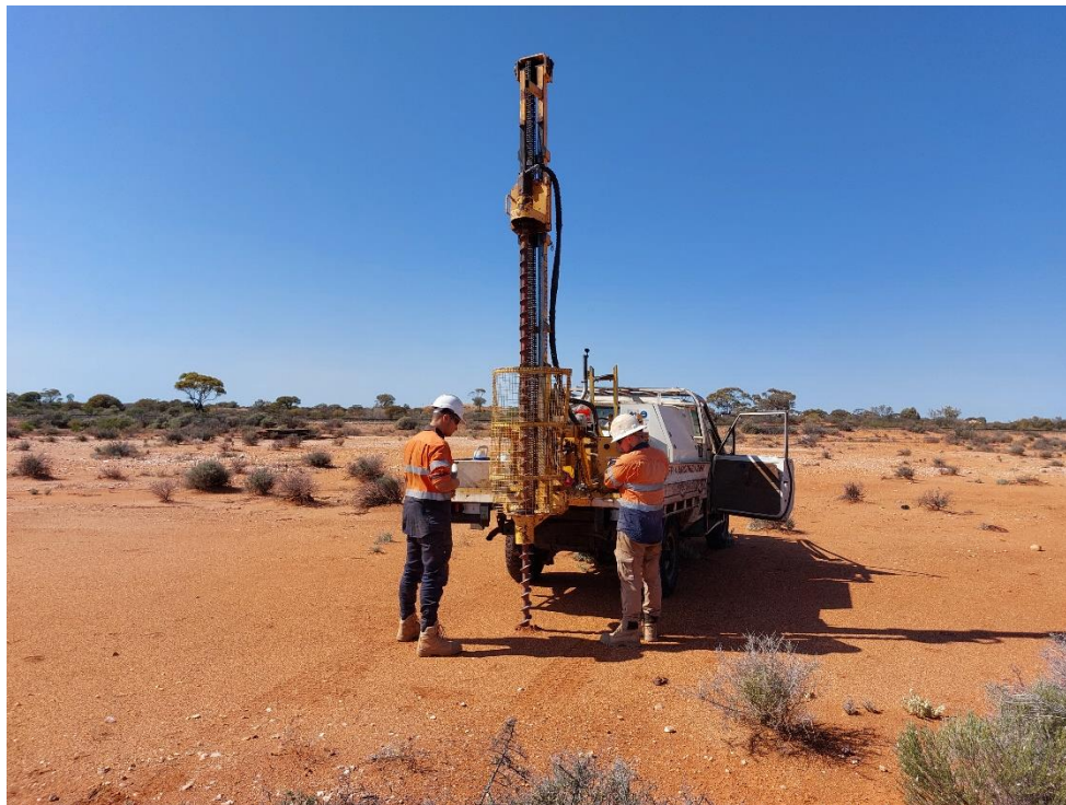
Figure 1: Final hole being drilled at Niagara West tenements by Gyro Australia

Gyro Australia undertook the augering campaign under the supervision of CSA Global, within schedule and budget, zero safety incidents and in a low impact manner that required no vegetation clearing.