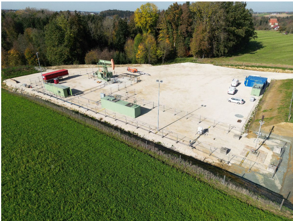
Anshof-3 well and early production unit