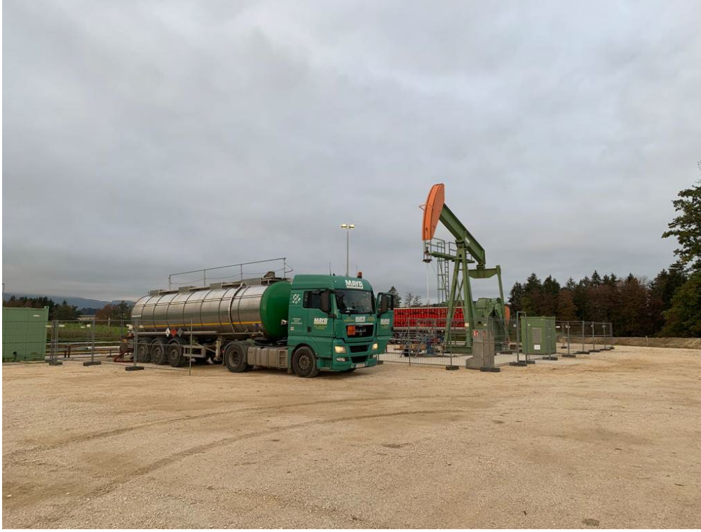
Oil tanker offloading at Anshof-3 location

The Operator, ADX Energy Limited, has advised that Anshof-3 is currently producing 100 barrels per day of oil (BOPD), 20 BOPD net to Xstate. The well productivity is at the upper end of the Operator's expectation, but production is currently limited by on site storage capacity and truck frequency transportation limitations. The production performance from the well will be observed to determine the production capacity and continuity of the Eocene reservoirs.