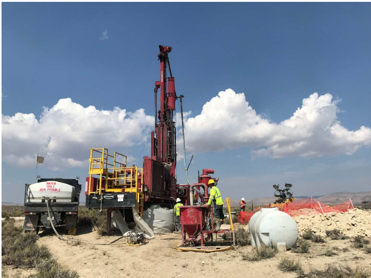
Figure 2. RC drilling at McDermitt (October 2022)