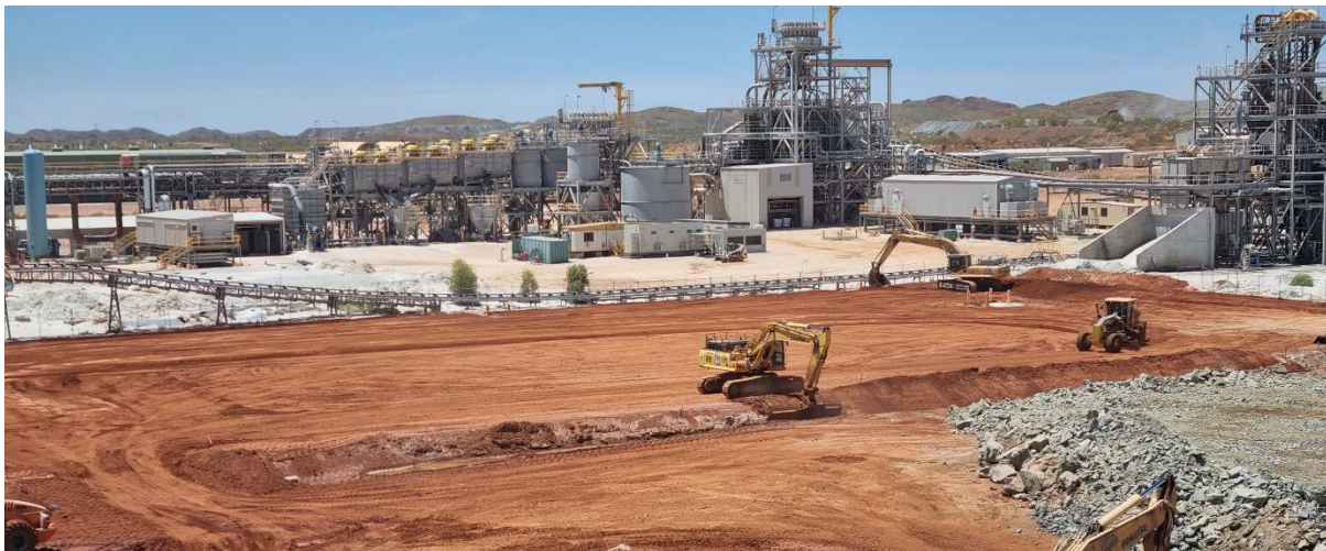
Figure 2: Bulk earthworks underway for P680 project

Commissioning of the primary rejection circuit is expected to begin in the September Quarter 2023, with ramp-up during the December Quarter 2023. The new 5Mtpa crushing plant and ore sorting facility is expected to be completed and begin commissioning in December Quarter 2023. Once completed, the expansion is expected to increase the combined total production capacity for the Pilgangoora Project to approximately 640-680,000 tpa ( P680 Project ).