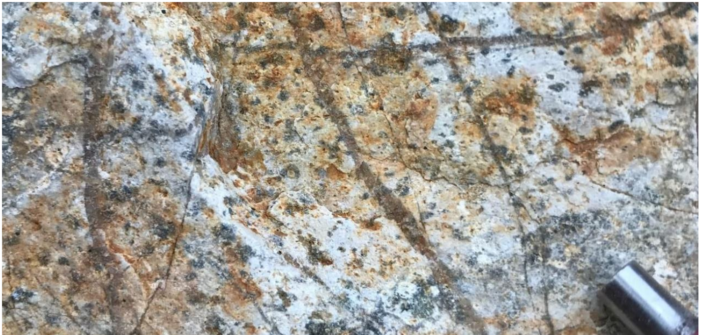
Figure 2. Translucent granular quartz veinlets associated with copper-gold mineralisation.

A copper-gold mineralisation event has also been identified as a separate and later mineralisation event, crosscutting the copper-molybdenum east-west trend. Future exploration and drill targeting will aim to follow this gold trend at depth.