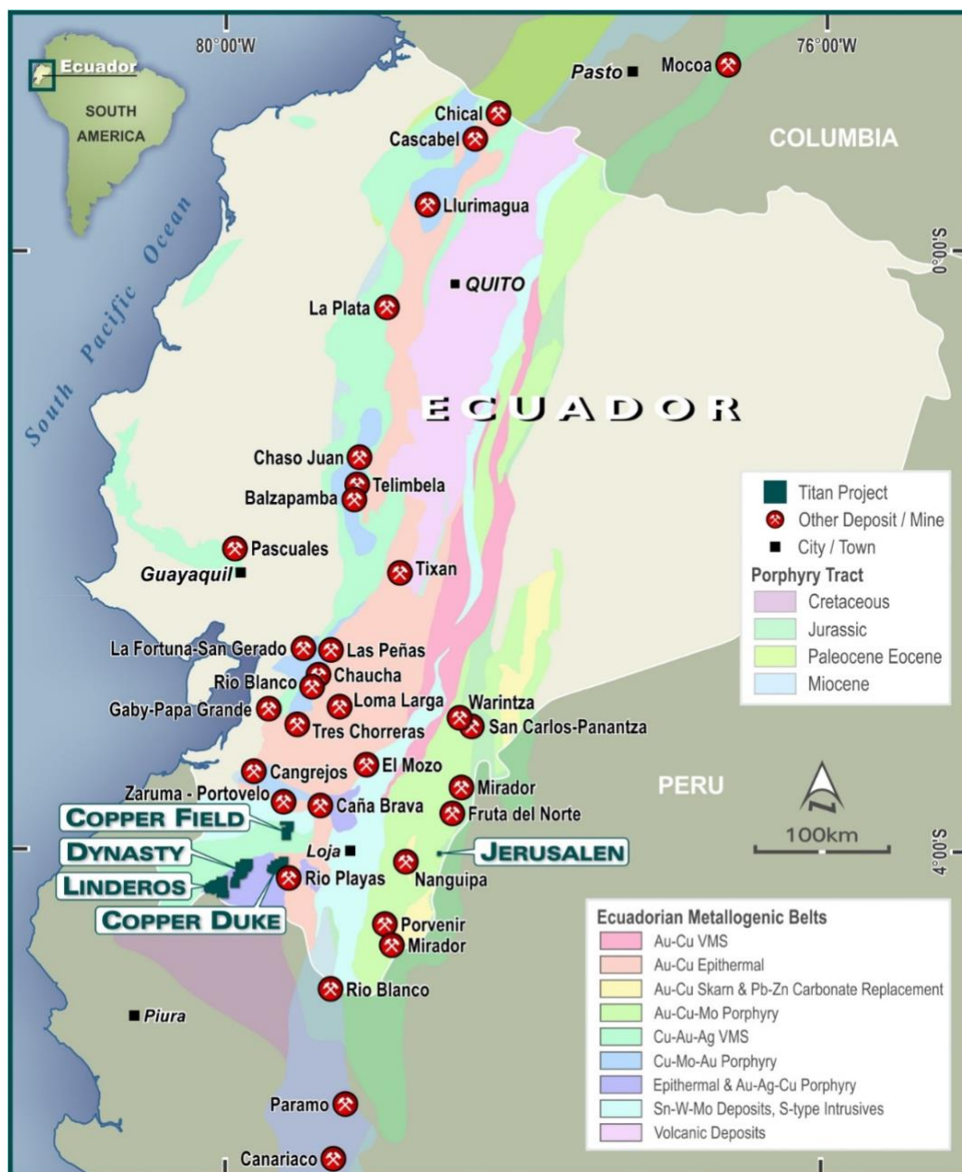
Figure 4: Linderos Project location map in relation to Titan Minerals Southern Ecuador Projects, and the metallogenic belts of Ecuador

Located in a major flexure of the Andean Terrane, the Linderos Project is situated within a corridor of mineralisation extending from Peru through northern Ecuador that is associated with early to late Miocene aged intrusions. The majority of porphyry copper and epithermal gold deposits in southern Ecuador are associated with magmatism in this age range, with a number of these younger intrusions located along the margin of the extensive Cretaceous aged Tangua Batholith forming a favourable structural and metallogenic corridor for intrusion activity where Titan minerals holds a significant land position in southern Ecuador.