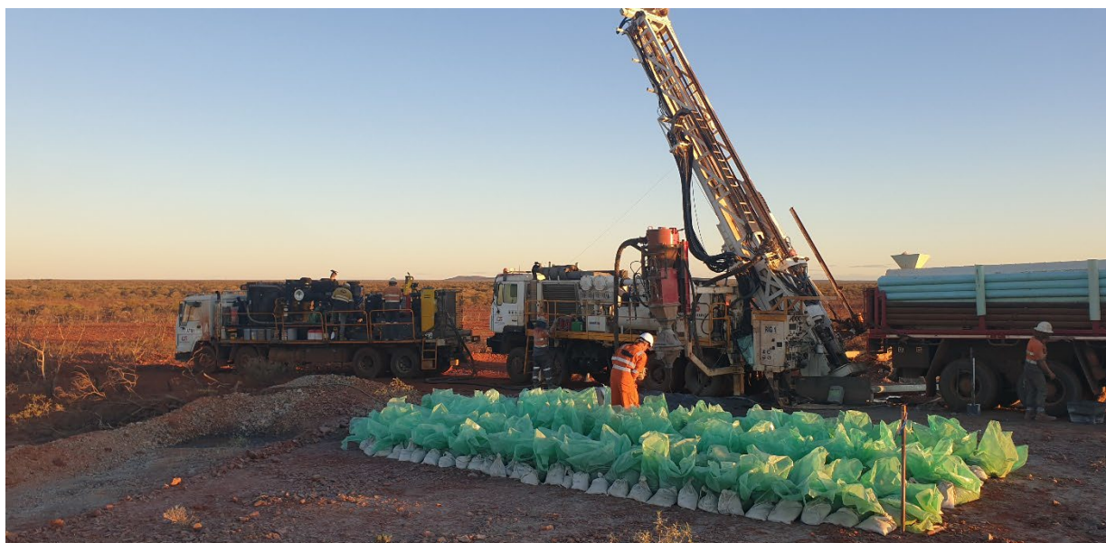
Figure 2 - Phase 2 Drilling at Tumblegum South

The next stages of drilling were two separate programs.