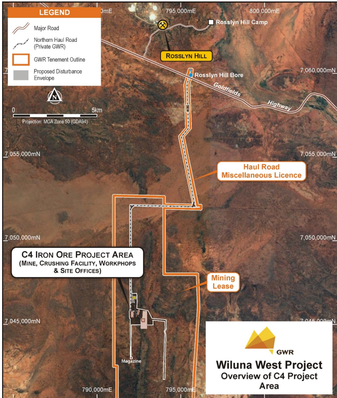
Figure 1: Overview of C4 Project Location