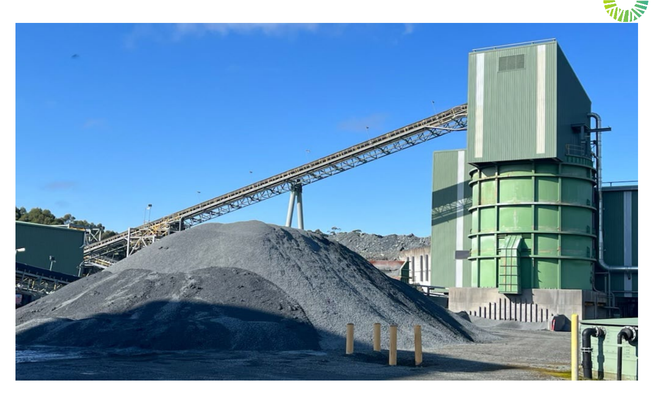
Figure 5. Stockpile of crushed ore adjacent to the fine ore bin from the crushing circuit.

The grinding and flotation circuits have also been performing well. After resolving early commissioning challenges MYL's team has shifted its focus to process control and preventative maintenance operations. The retreatment circuits have not yet been commissioned but are expected to further improve performance.