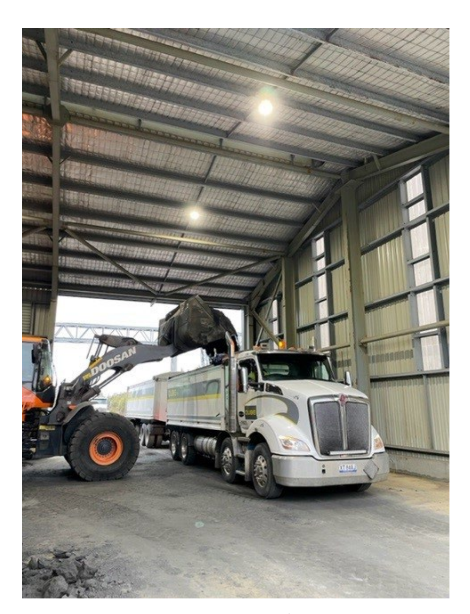
Figure 1. First concentrate being loaded out from the Avebury mine