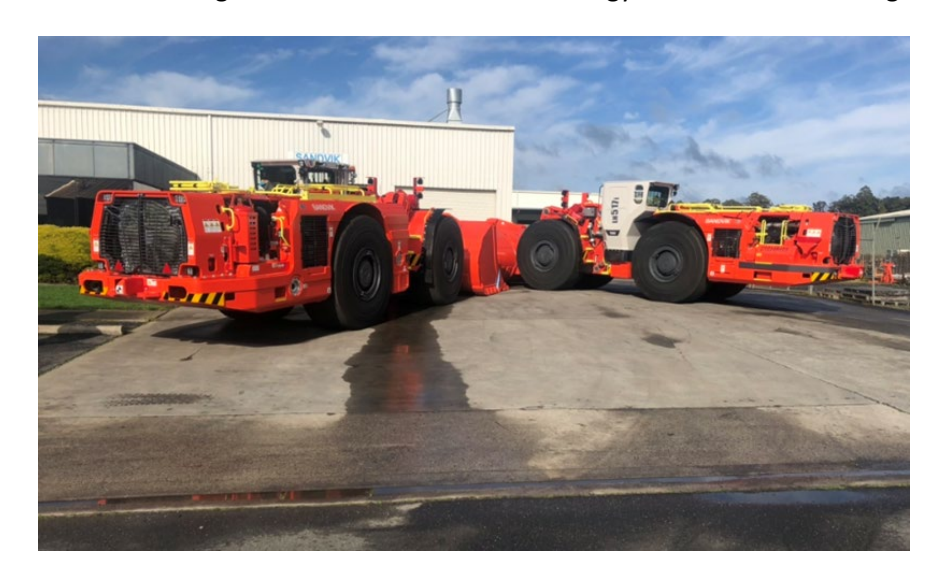
Figure 2. New underground mine loaders.

An underground mining fleet has been assembled on site through the support of several mining equipment providers who have shown faith in the future of the operations at Avebury. This includes two new Sandvik underground mine loaders configured with tele-remote technology to enable safe underground loading.