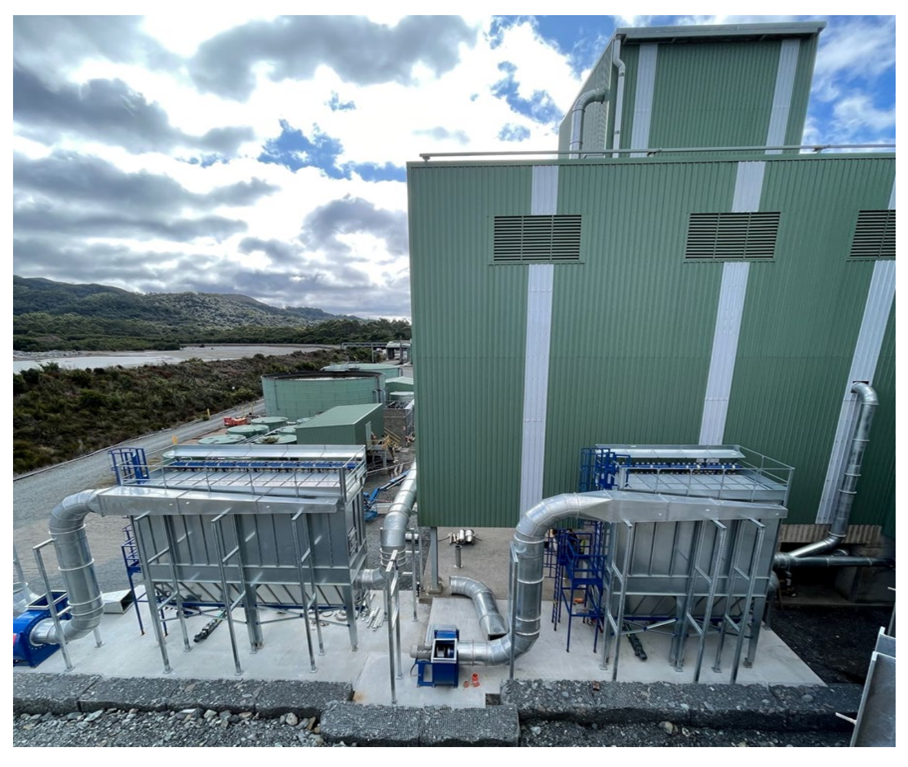
Figure 4. Dust Extraction System at the Crusher House

Commissioning of the crushing circuit, including the recently constructed dust extraction system, has been outstanding. The crushing circuit is consistently producing a product appropriately sized for the grinding circuit and is producing enough daily feed for the grinding circuit after approximately 14 hours of crushing per day, demonstrating capacity for crushing at expanded rates of throughput.