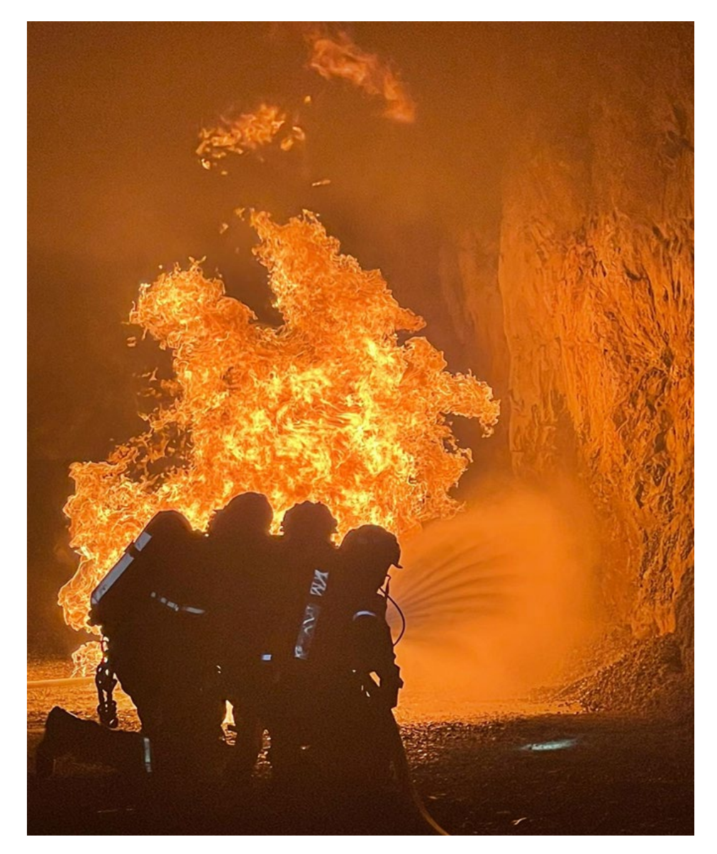
Figure 9. Underground live fire training at Avebury

The Company's mining operations maintained compliance with regulatory and operating license requirements during the period.