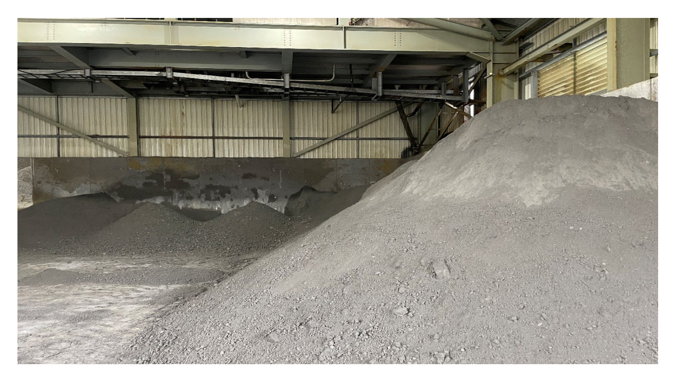
Figure 7. Stockpiled concentrate in the concentrate storage shed

Final concentrate is transported to Burnie where it awaits shipment to customers of Hartree Metals LLC, the Company's offtake partner. Under the terms of the offtake agreement, the Company may elect to receive partial advance payment for interim concentrate stored, pending shipment to Hartree's customers, with the balance to be paid on completion of each shipment. In accordance with the terms of the offtake agreement, the Company has received its first partial advance payment for concentrates from Hartree. In this way, the Company is able to receive part-payment for interim production, prior to the completion and dispatch of a shipment.