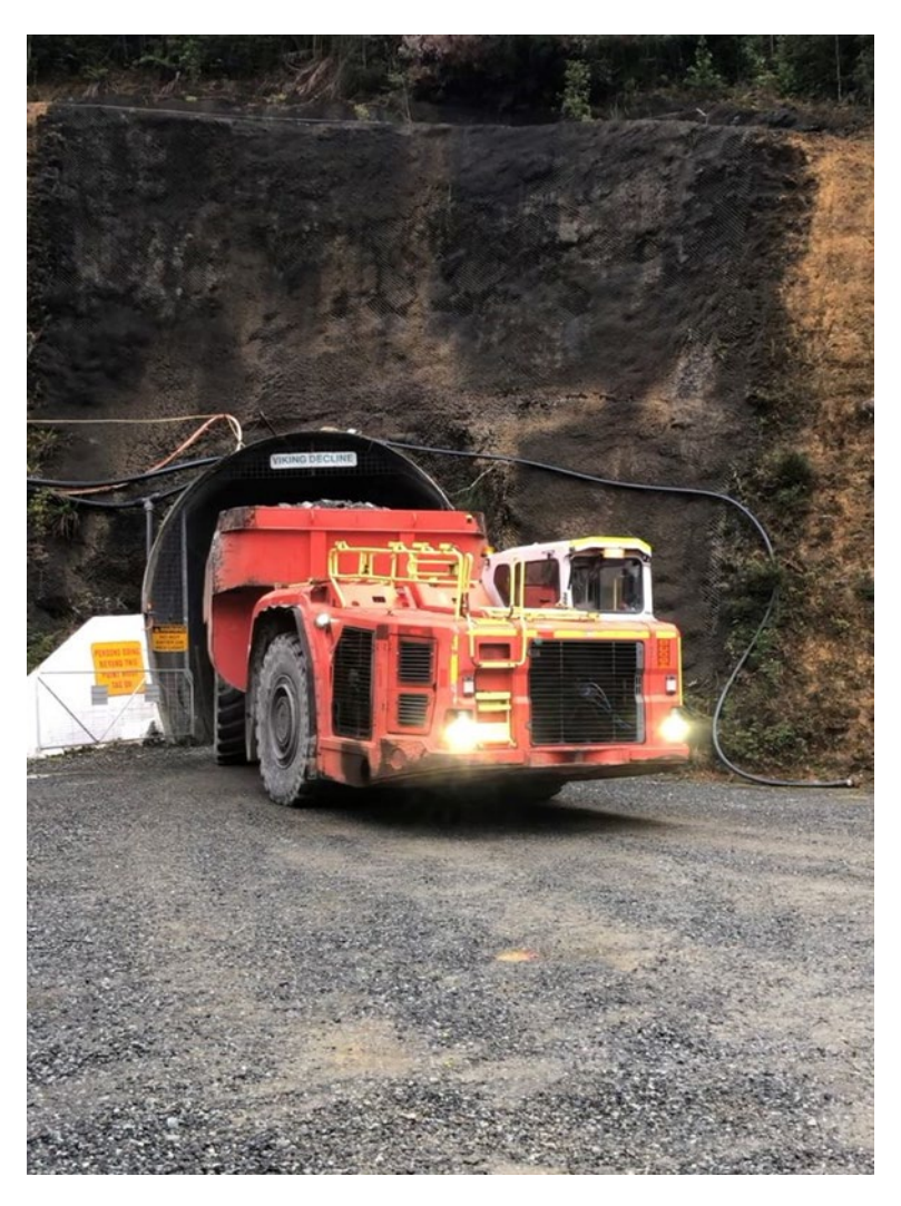
Figure 3. Mine production leaving Viking decline.

At the same time, our technical, planning and administration staff have established systems to design, control and administer the operation. We have installed safety and risk management systems, environmental controls, and we have established an enviable community liaison capability. All of this was achieved within a bare six months since Mallee first arrived on site in March".