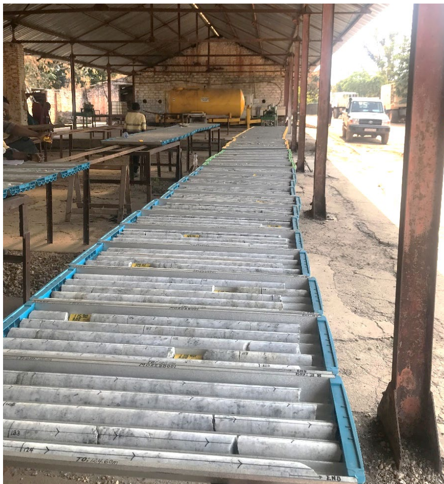
Figure 2: Top 3 rd of drillhole MO22DD001 down to 124.6m laid out for lithological logging