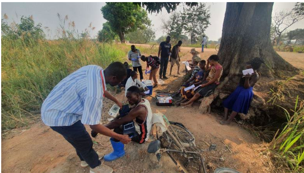
Figure 5: International researchers undertaking their healthcare mission at Manono