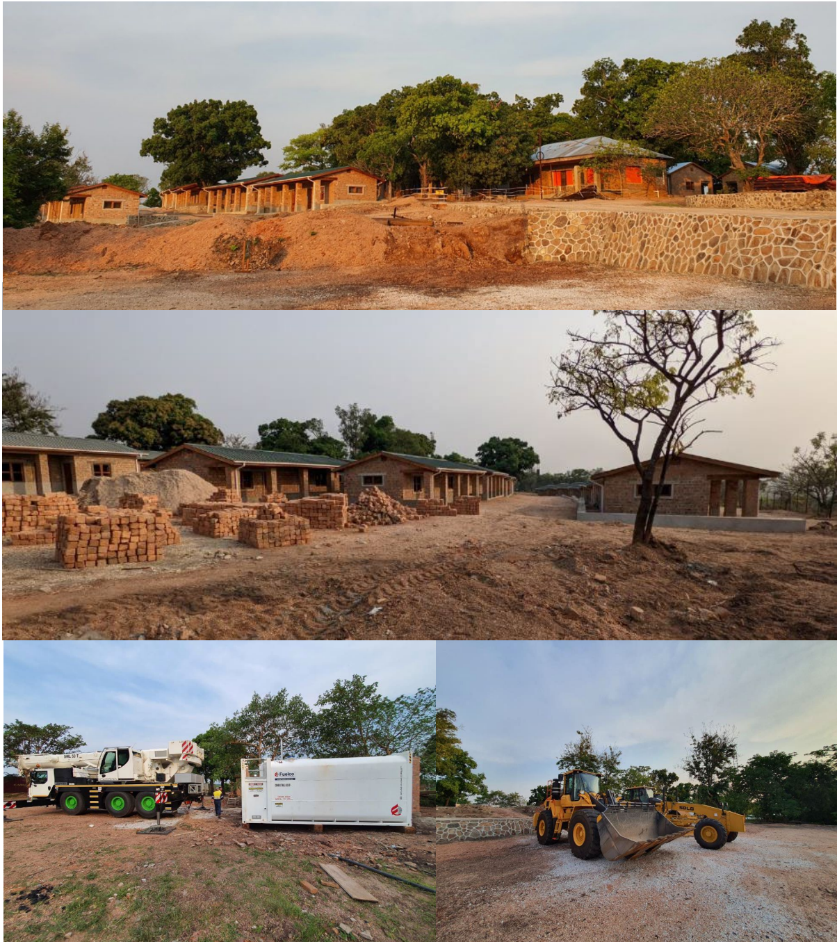
Figure 6: Accommodation and construction progress at Camp Colline

The Company has also purchased mobile equipment including a wheel loader, grader, compactor, 50-tonne crane and self-loading concrete mixer.