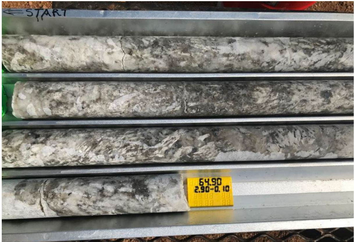
Figure 3: Close up of visible spodumene in MD22001 at 64.9m downhole