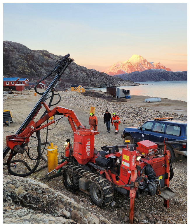
Figure 1: Exploration underway at Eclipse's lvigtût project in Greenland

Eclipse's Executive Chairman Carl Popal has been supervising activities with assistance from Greenlandic geological consultants, drilling and earthmoving contractors. Using recently produced geophysical and remote sensing models as a guide, the program aims to collect sub-surface samples of the REE bearing carbonatite formation and to obtain samples of the lvigtût mine wall rocks.