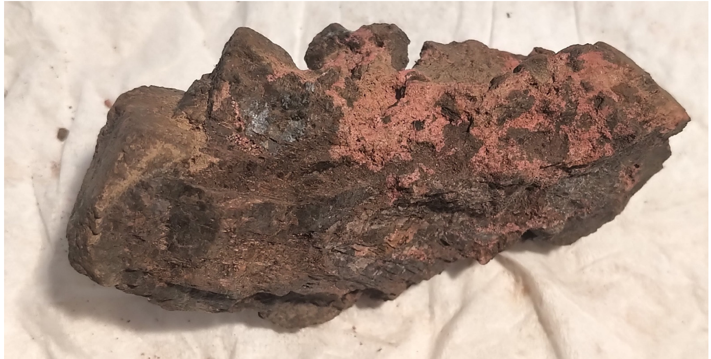
Figure 4: Image of sample sent to St Andrews university for assessment