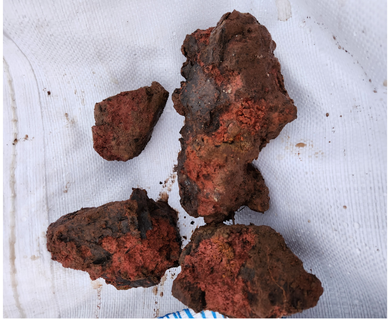
Figure 5: Trench samples showing altered dolerite dyke with pink mineral and highly altered carbonatite with magnetite (similar to samples sent to St Andrews University).