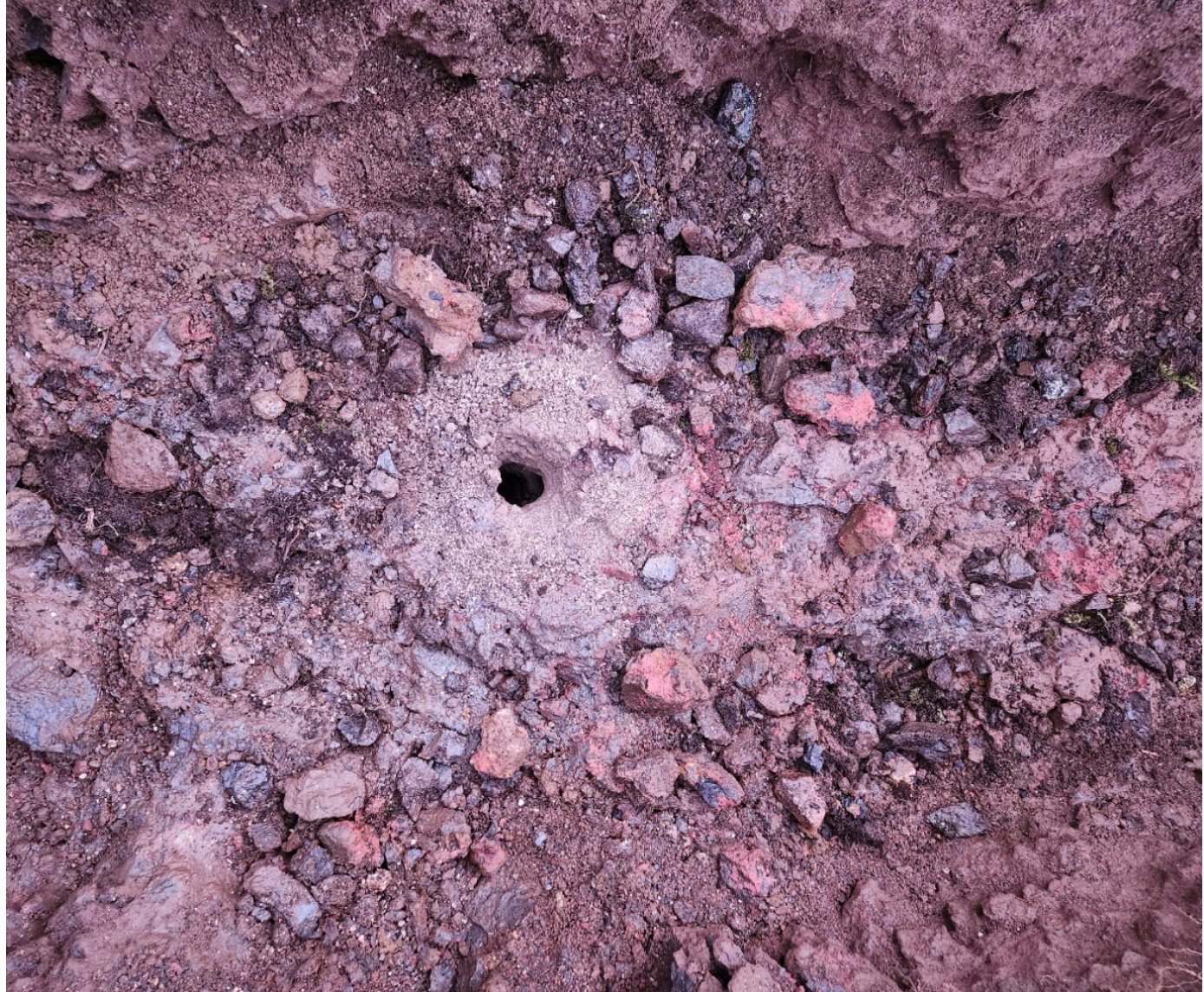
Figure 3: L5-9 Trench and drill hole image at Grønnedal showing altered magnetite with pink mineral, possible bastnasite. Similar to samples sent to St Andrews University.

In August 2022, Eclipse sent samples of the dyke containing pink-coloured minerals to St Andrews University in the UK for assessment. XRD examination of the sample indicated the pink mineral as possibly being bastnasite enriched in REE carbonates.