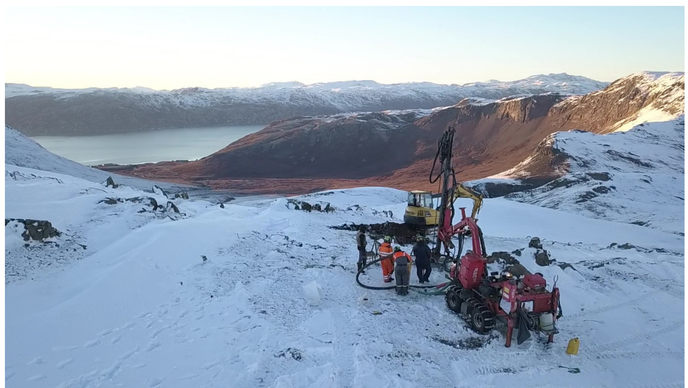
Figure 2: Drilling at the Grønnedal carbonatite complex

The Gronnêdal Carbonatite was partially drill-tested in the mid-1900s to evaluate small-scale magnetite seams. More recently, surface samples collected by Eclipse returned significant values for a range of rare earth element (REE) bearing minerals (ASX Release 24 March 2022). No systematic exploration has been conducted in the area until the current program.