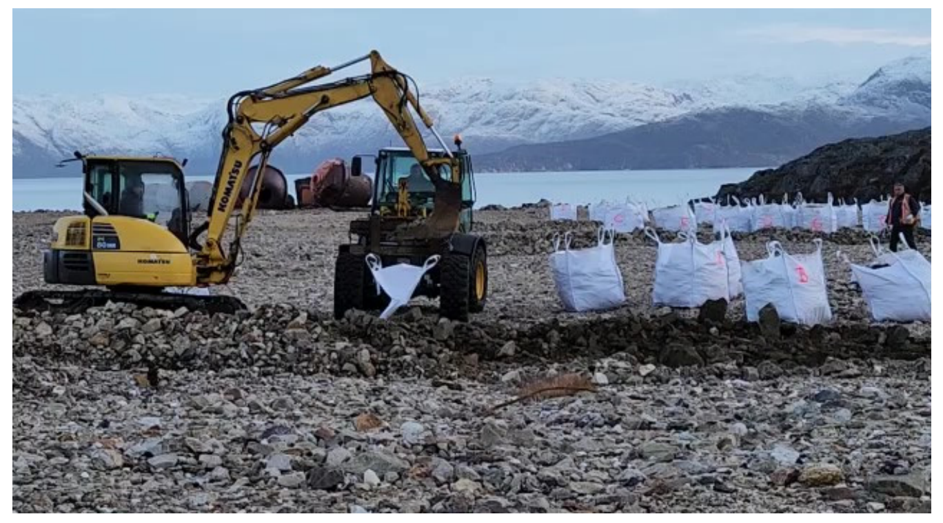
Figure 6: Collecting trench samples at lvigtût

Nine holes were drilled in proximity to the mine during the latest program to obtain fresh samples for assessment of the geological setting and potential REE content of these formations.