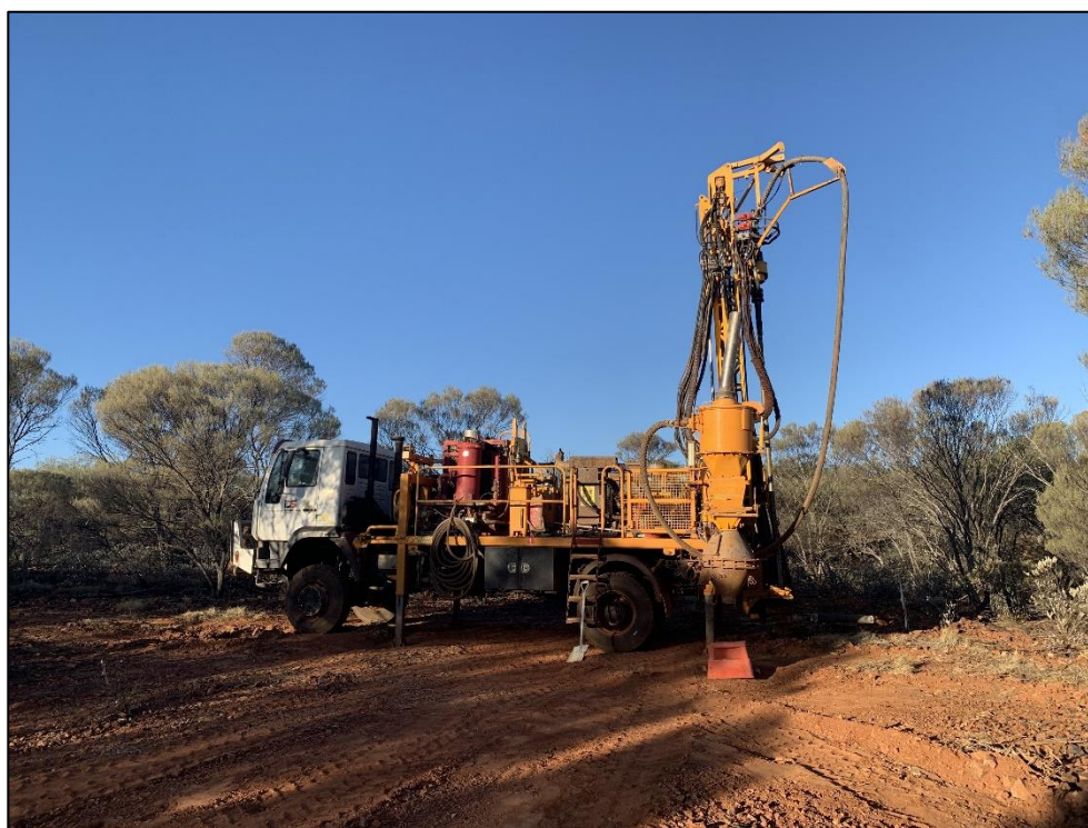
Figure 1 - RC drill rig set up at Weelarrana Manganese Project