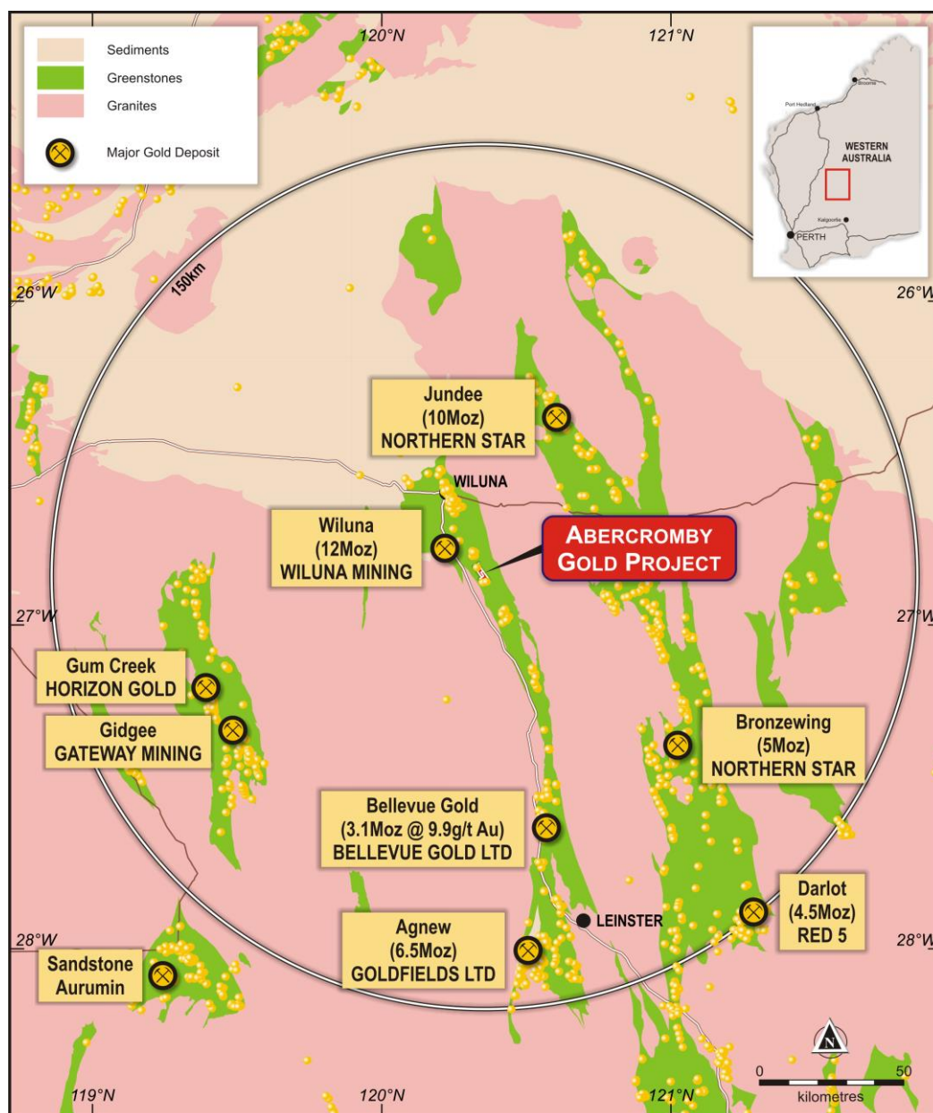
Figure 3 - Abercromby location in an established gold mining region with other major operations highlighted

BMG holds 100% of Abercromby, which comprises the gold and other mineral rights (ex-uranium) of two granted mining leases (M53/1095 and M53/336).