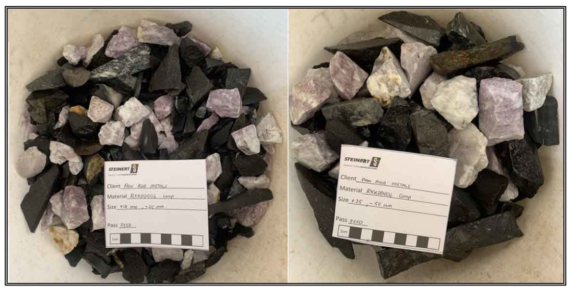
Photo 1. RKDD006: Sub-sample of crushed core feed for ore sorting, LHS +10mm to -25mm RHS +25mm to -50mm

The ore sorting sample is from drillhole RKDD006 and comprises half HQ core (63mm diameter) for the interval 54.5m to 81.5m . The total sample weight was approximately 107kg. The core was crushed at Nagrom in Perth and sized to -50mm, +25mm and -25mm, +10mm. A -10mm fines product was also produced. The crushed core samples show good physical separation of aplo-pegmatite, which is purple-white, from the siltstone which is dark grey to black (see Photo 1).