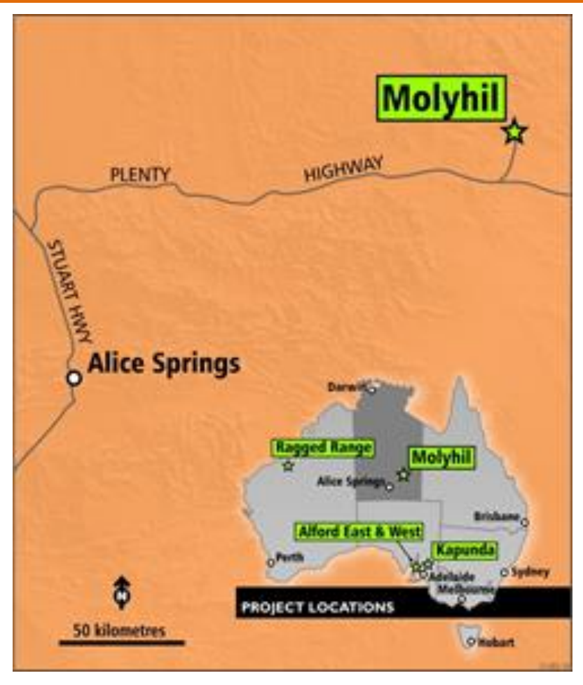
Figure 1: Tenement & Prospect Location Plan

The Bonya tungsten and copper tenement (EL29701) is located approximately 30km to the north-east of Molyhil (Figure 1). Thor, in joint venture with Arafura, holds a 40% equity interest in the tenements.