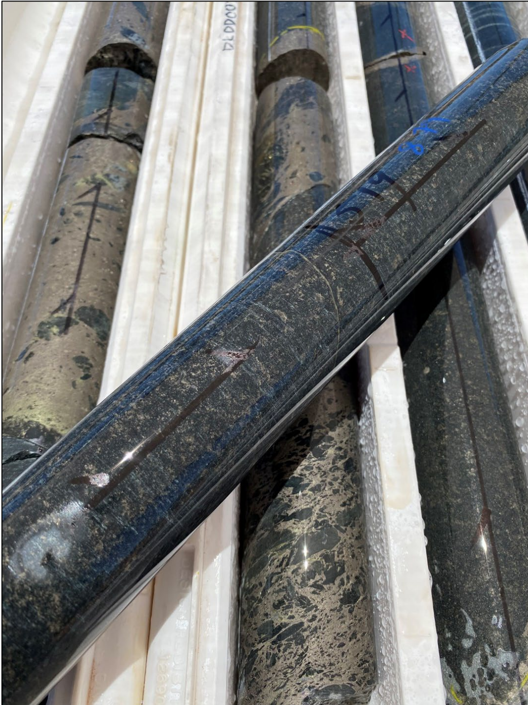
Figure 2: Ultramafic with 20% blebby sulphides