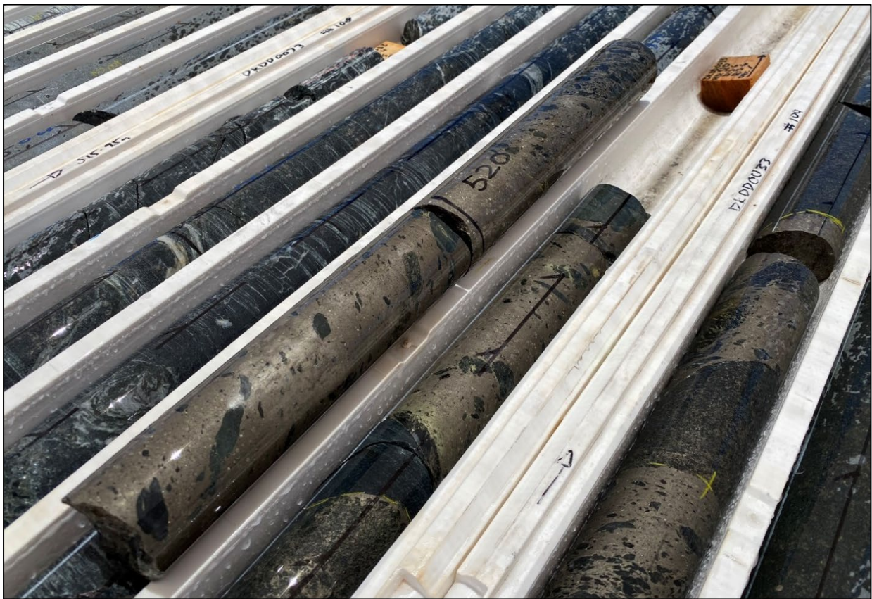
Figure 1: Massive sulphides in DKDD0033 at Rosie