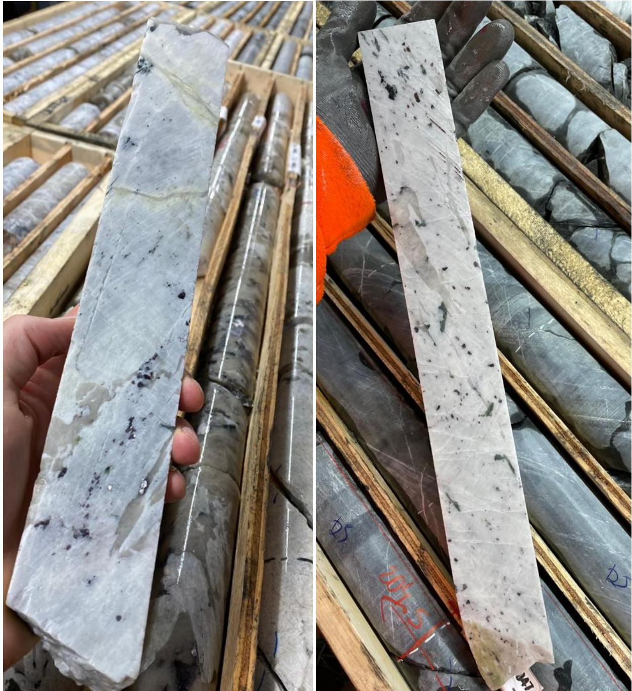
Figure 3: Segment of 1.8 m spodumene crystal at ~225 m depth in CV22-066