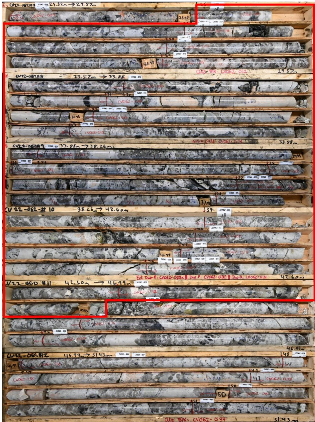
Figure 4: Interval of 18.0 m at 2.16% Li 2 O (26.0 to 44.0 m) within a wider zone of 60.0 m at 1.52% Li 2 O (25.3 m to 85.3 m) in drill hole CV22-062