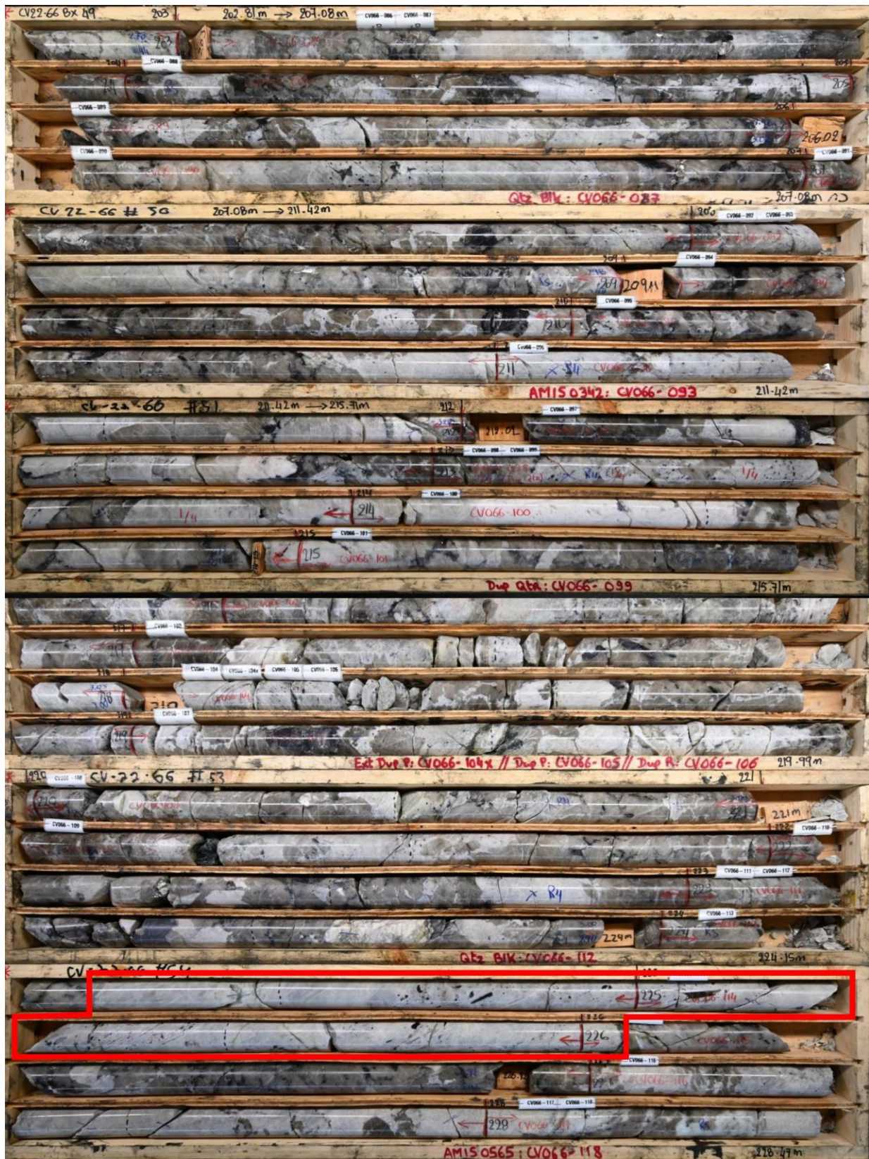
Figure 2: Well mineralized drill core intersection (~2.5% Li 2 O average) in CV22-066 with a 2.0 m at 6.41% Li 2 O interval (224.0 to 226.0 m) containing an ~1.8 m long spodumene crystal (highlighted in red box)