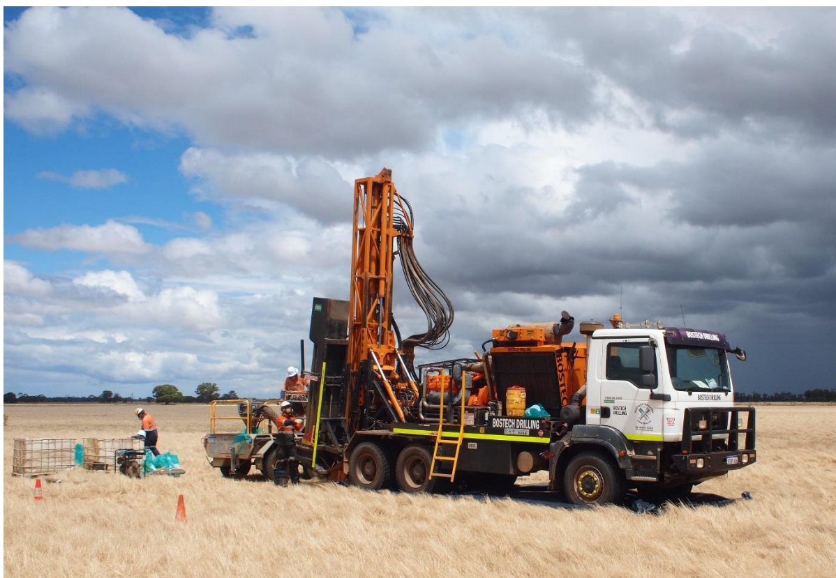
Figure 2 Aircore drill rig at the Pyramid Hill Gold Project

This announcement has been approved for release by the Board of Falcon Metals.