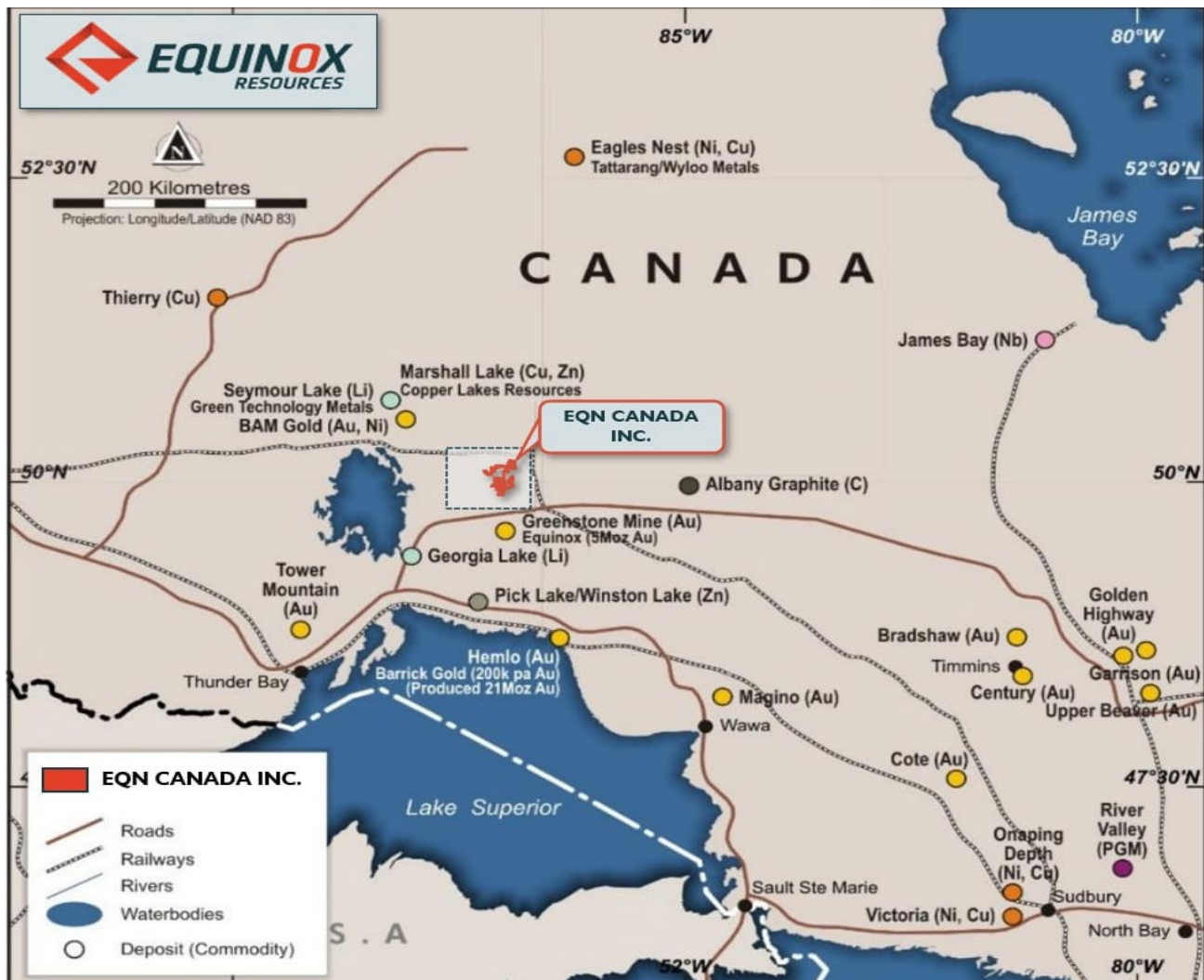
Figure 2 – Area Location Map

Equinox's prospectus dated 31 August 2021 as supplemented by the supplementary prospectus dated 7 September 2021 (together, the Prospectus) outlined the Company's use of funds (Use of Funds), whereby Equinox has allocated $200,000 for project generative activities.