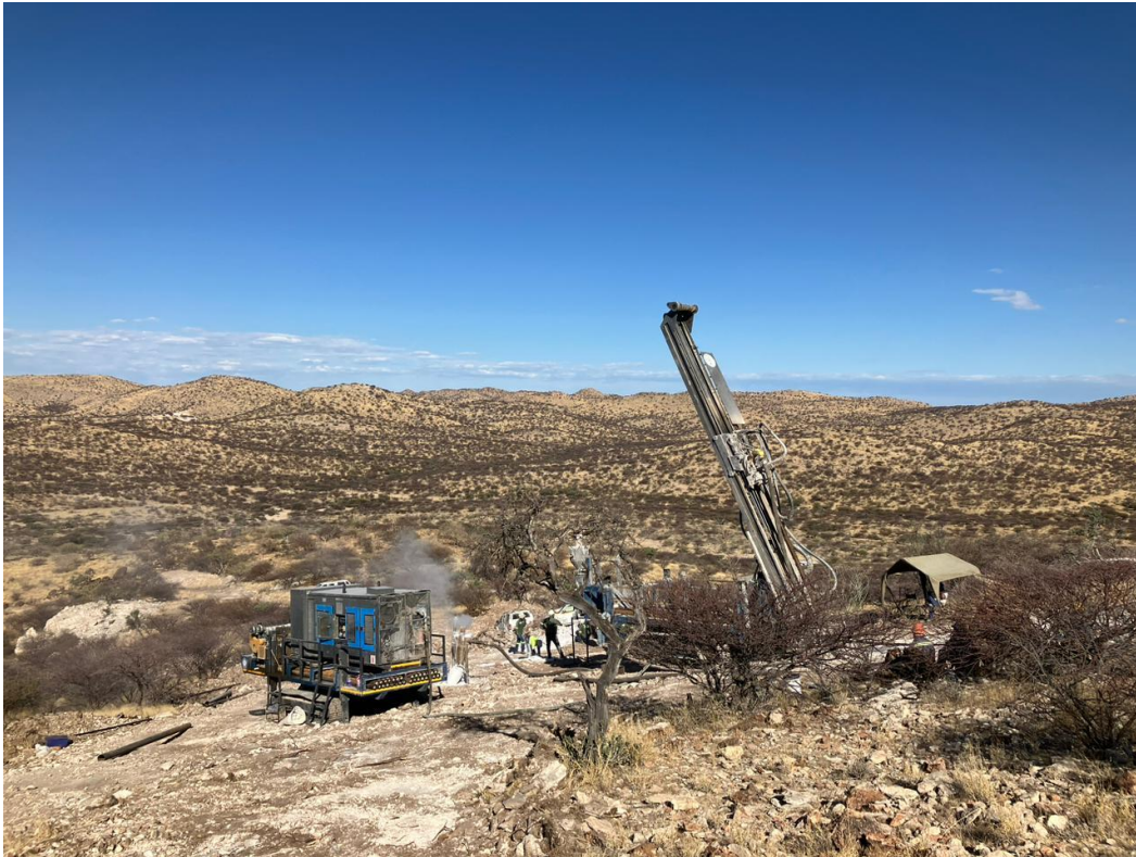
Figure 1. Drilling in progress at Omaruru