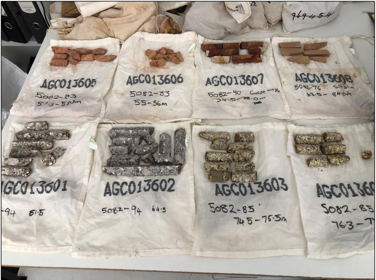
Figure 3: Photograph of samples taken from historic drill core, ready for the laboratory. Nyora granite (front) and siltstones (rear).