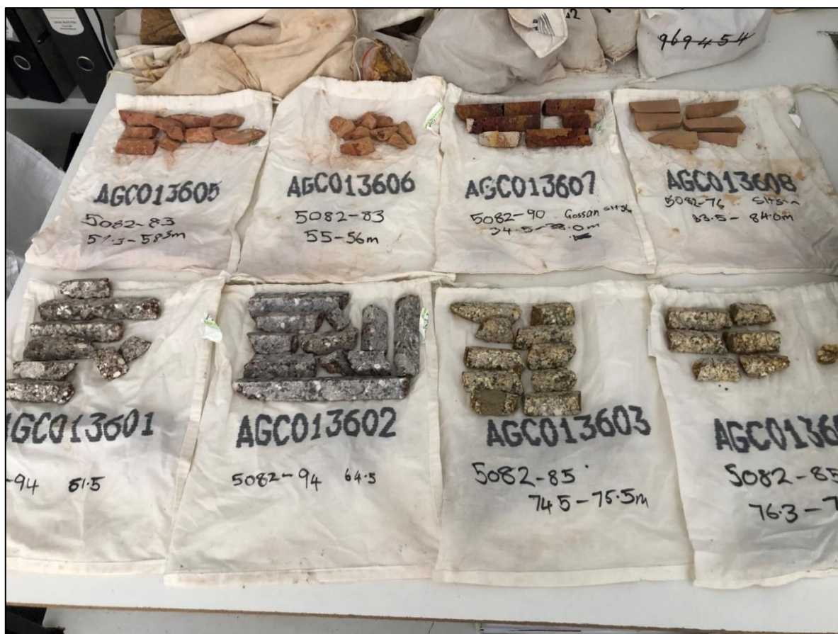
Figure 3: Photograph of samples taken from historic drill core, ready for the laboratory. Nyora granite (front) and siltstones (rear). 1

1 In relation to the photograph above, the ASX considers that photographs of drill core may be deemed a visual estimate of mineralisation. The Company cautions that visual estimates of mineral abundance should never be considered a proxy or substitute for laboratory analysis. Laboratory assay results are required to determine the grade of the visible mineralisation reported in historic samples. The Company will update the market when laboratory analytical results become available.