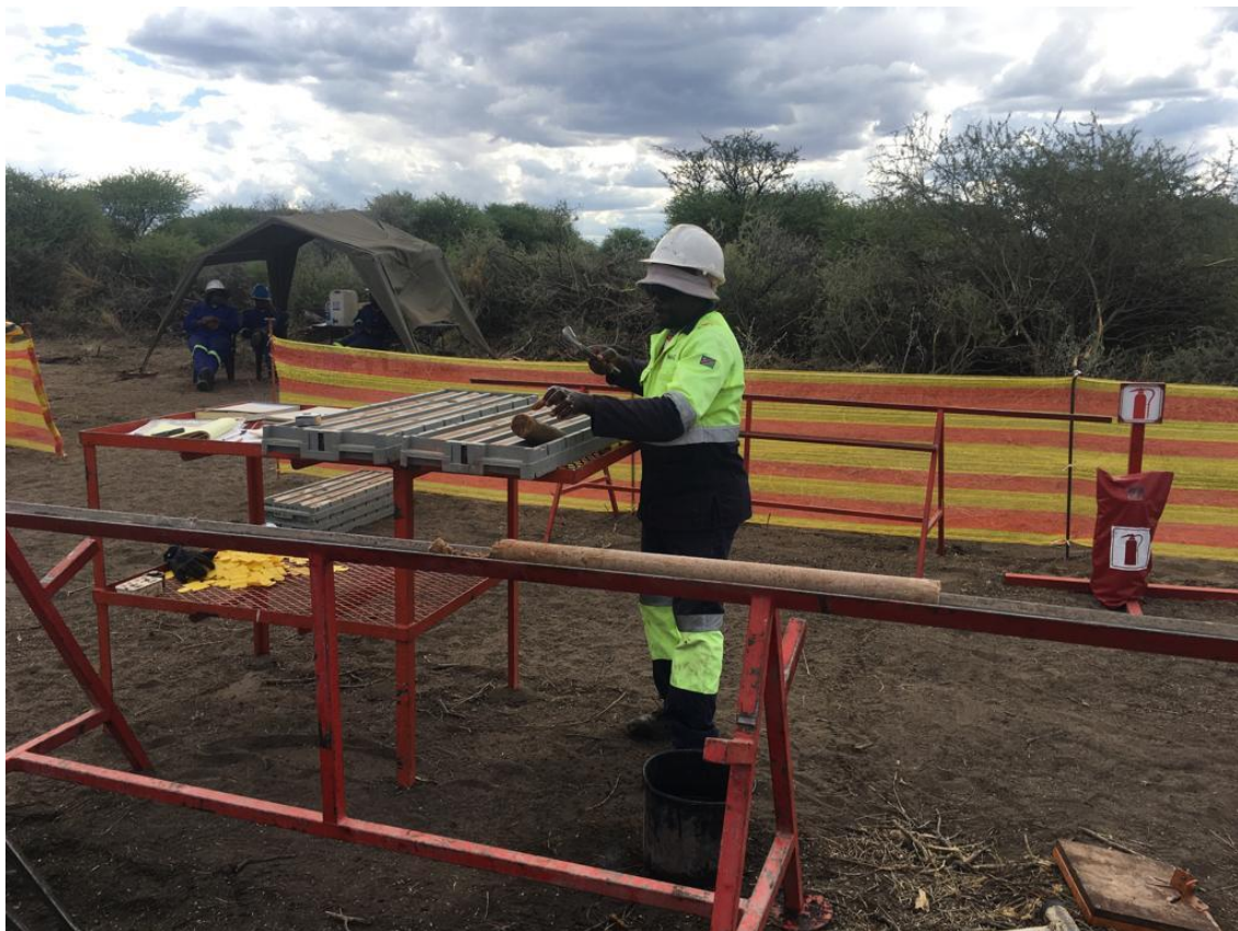
Figure 2. Diamond core being processed on site at 22HED01

The first hole 22HED01 is testing the NPF-D'Kar contact on the southern limb of the 'domal' target. (Fig 4). Ground magnetic profiles have been collected to pinpoint the contact under the Kalahari cover (Fig 5).