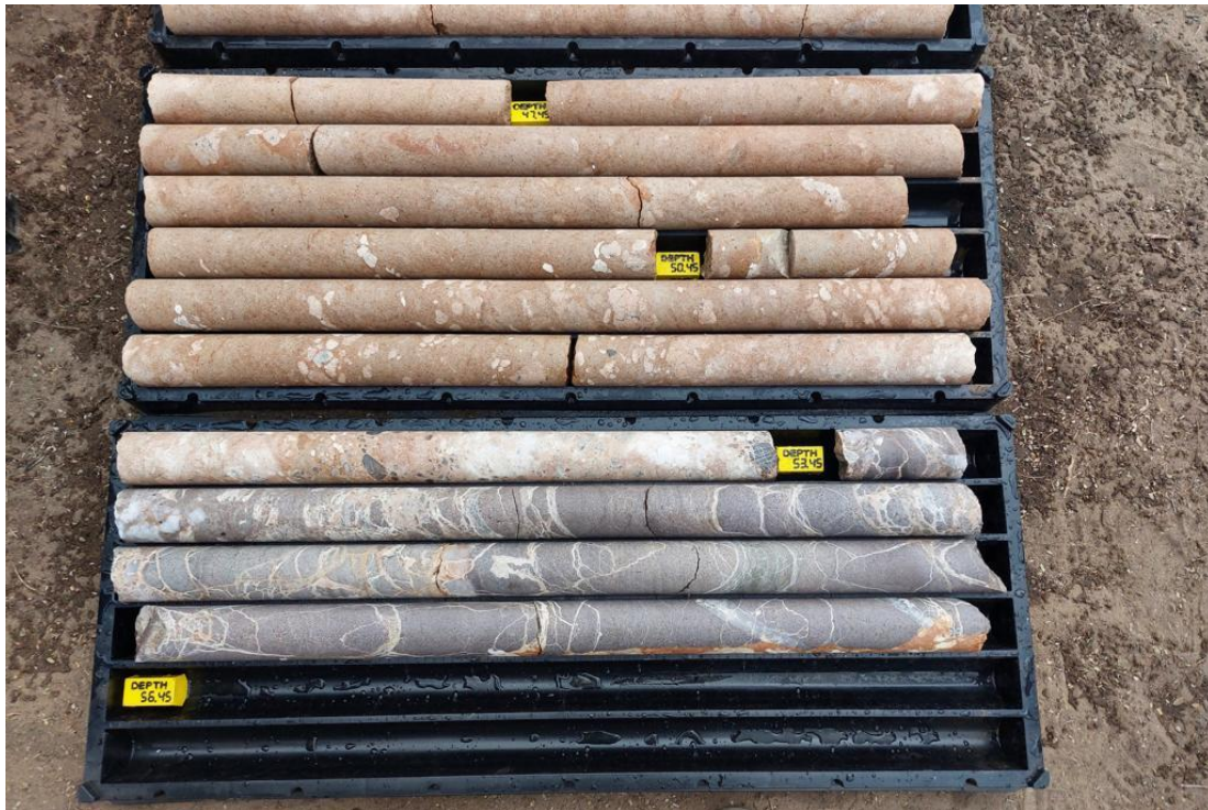
Figure 3. Diamond core defining the base of the Kalahari cover sequence with a thick calcrete developed above the interpreted D'Kar Formation sediments.