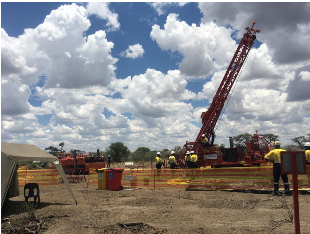
Figure 1: Diamond drilling underway at the Helm prospect, Snowball JV

The company is pleased to confirm that the company's first diamond drilling program is underway at the Snowball Joint Venture. Diamond drilling has been selected to drill the shallow Kalahari sand cover and provide detailed geological information in a previously undrilled part of the Kalahari Copper Belt.