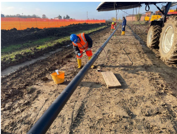
Welding electro-shrink bands (cathodic protection)