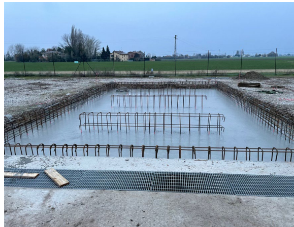
Steel frame and concrete casting for water disposal tank