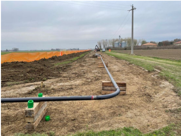
Welded 4" pipes