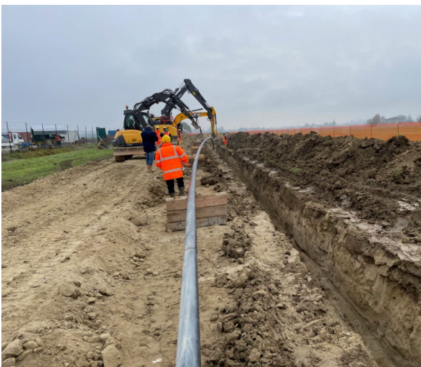
Pipe laying has commenced