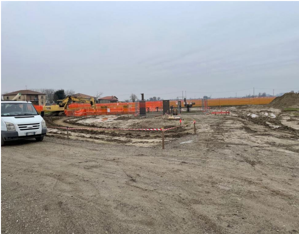
SNAM connection site