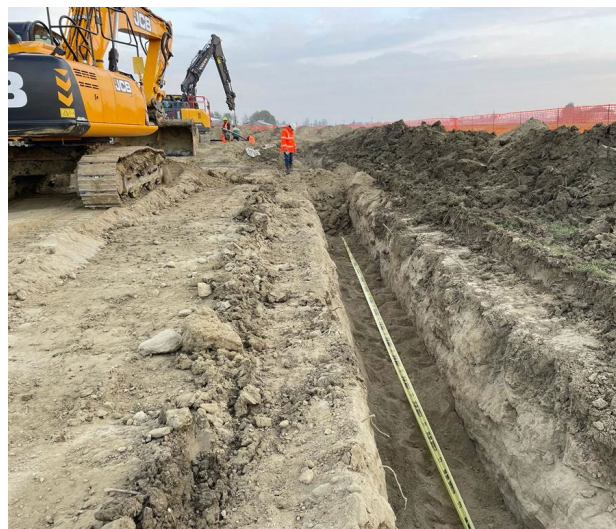
First phase of backfilling