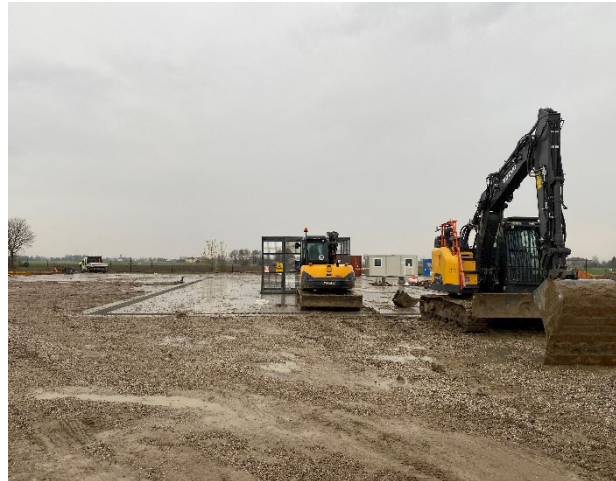
Works underway at Podere Maiar