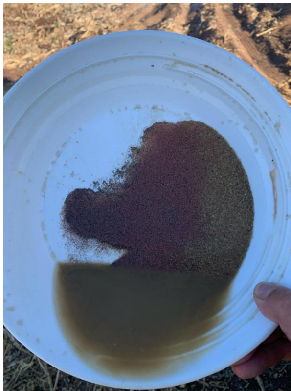
Figure 1: Visual confirmation of Garnet in recently completed drilling at Port Gregory

The Company will commence its maiden 1400 metre Air Core drilling program at the Red Hill Project Site in early January 2023. Assay results for the Red Hill Program are anticipated to be received in March 2023 with a potential resource being released in Q2 CY 2023 pending positive results. Timing for the release of the results from both drilling programs are subject to laboratory throughput capabilities and HVY interpretation and compilation.