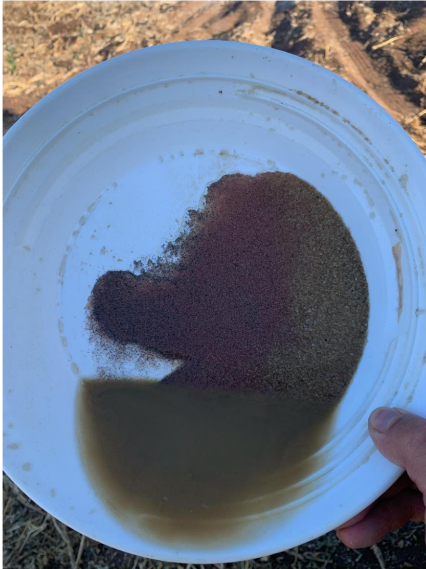
Figure 1: Visual confirmation of HM in panning of drill samples estimated at between 10 and 15% with an assemblage dominated by garnet (approximately 80 to 85%) in recently completed drilling at Port Gregory