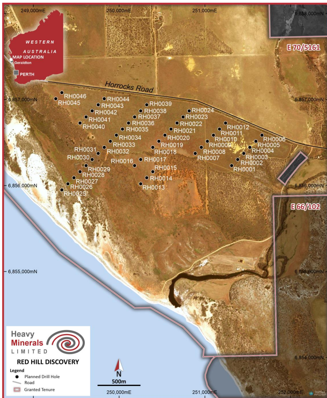
Figure 3: Red Hill Garnet Project

The maiden Air Core drilling program at Red Hill, will begin in early January. The objective of this program is to delineate a potential resource based on exciting results generated by the company during an Auger program earlier in the year. Figure 3 shows the planned drill holes for the program.