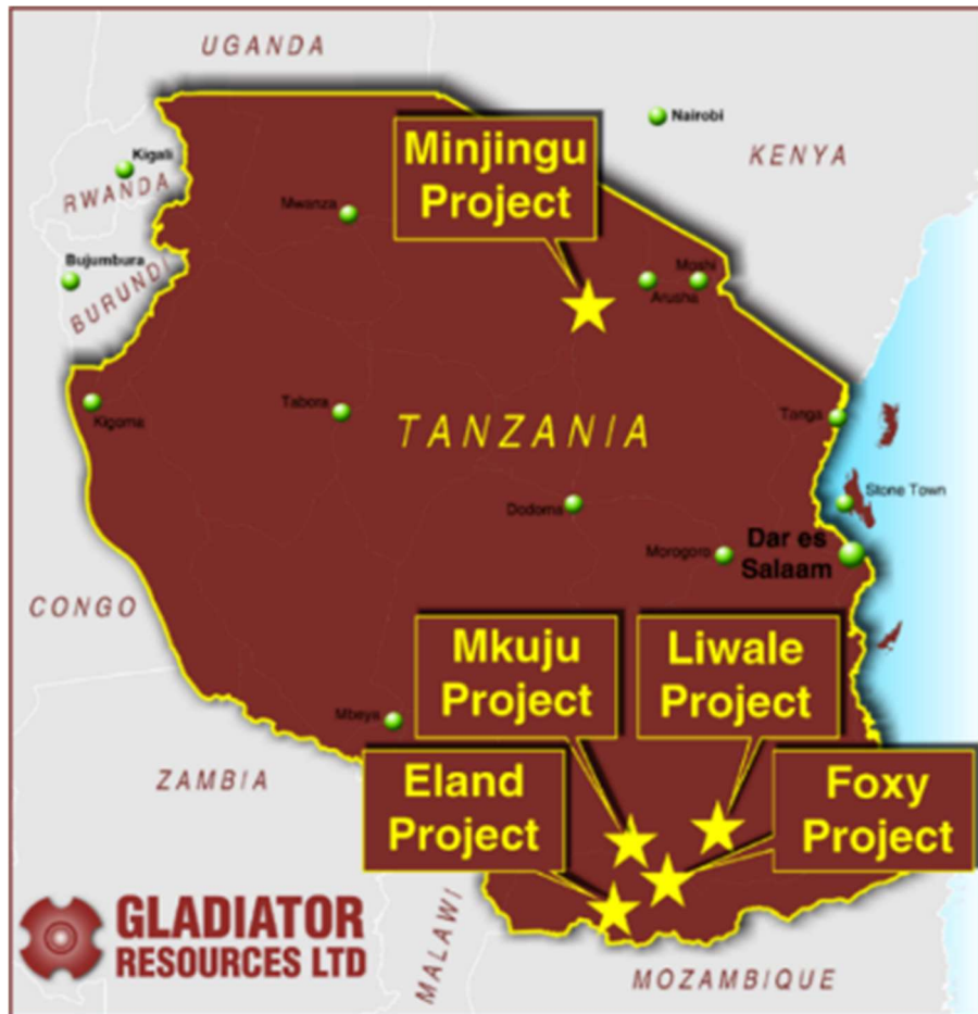
Fig 1 - Gladiator Uranium Exploration Projects in Tanzania

The Company holds 7 exploration licenses covering over 1,764km 2 in Tanzania, highly prospective for Uranium.