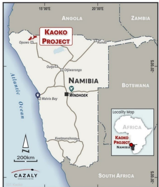
Figure 3. Location of the Kaoko Critical Minerals Project in north-west Namibia.

Cazaly's Managing Director Tara French commented, "We are extremely pleased to have completed this infill sampling with an in-country team. The lithium target covers an extensive area over 100 square kilometres, and the infill soil sampling will provide us with further detail on this anomalism. Now we await the assay results in order to determine the nature and distribution of the lithium and determine the next steps to further advance the project."