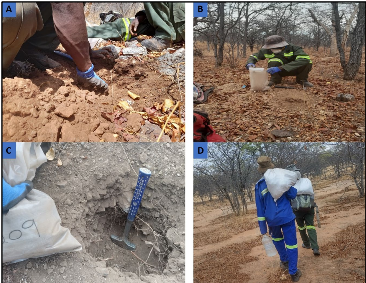
Figure 2. Collection of soil samples at the Kaoko Lithium anomaly.

Cazaly engaged Gecko Exploration (Pty) Ltd, a local Namibian consulting company, to conduct infill soil sampling at the Kaoko lithium anomaly. The sampling team comprised four geologists and assistants from the surrounding community for the duration of the soil sampling campaign.