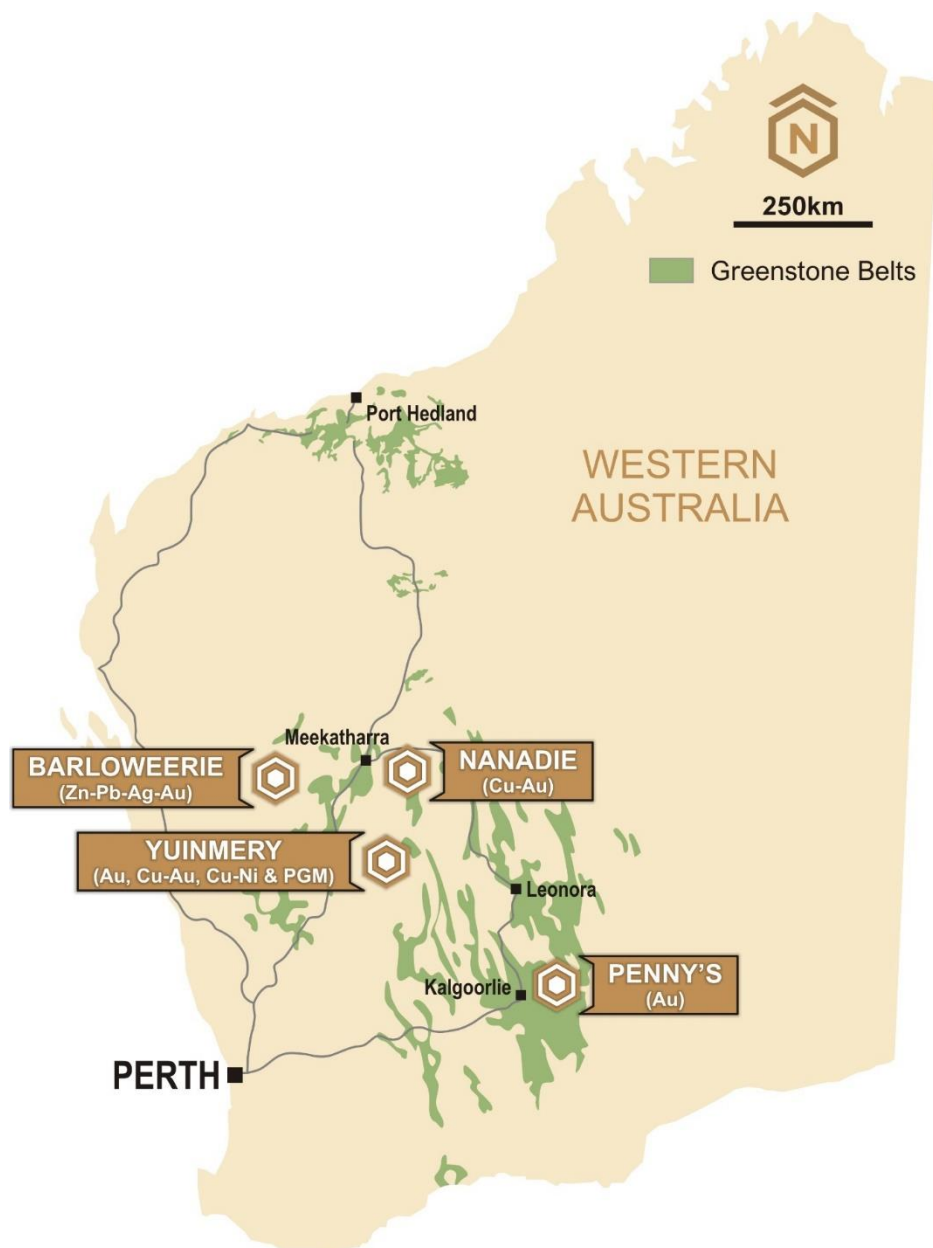
Empire Resources Project Location

Empire has an experienced team of exploration, development and financial professionals who are committed to developing a sustainable and profitable mineral business. Empire seeks to extract value from direct exploration of its existing projects as well as identifying value accretive investment opportunities that complement the Company's development objectives.