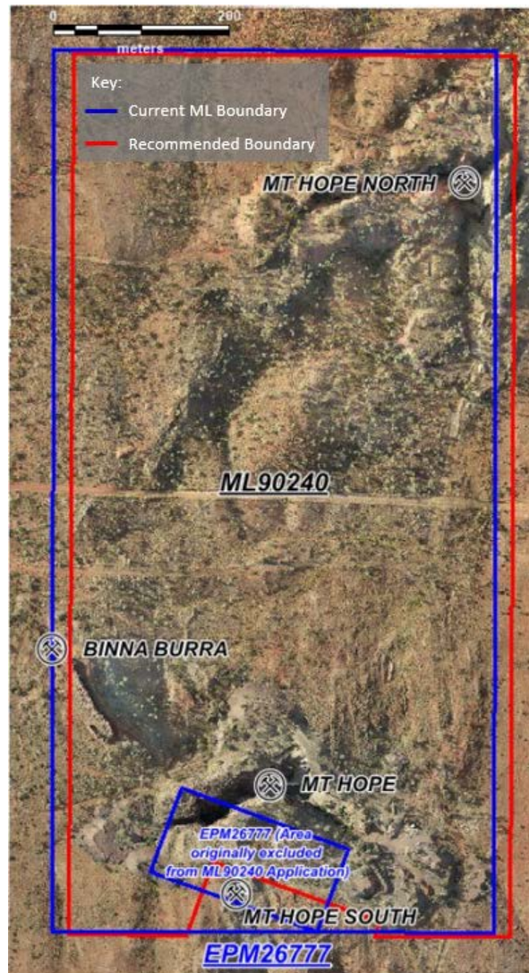
Figure 1: Existing EPM 26777 and ML90240 boundaries and potential changes

This announcement has been authorised for issue by Board of Directors for Hammer Metals Limited.