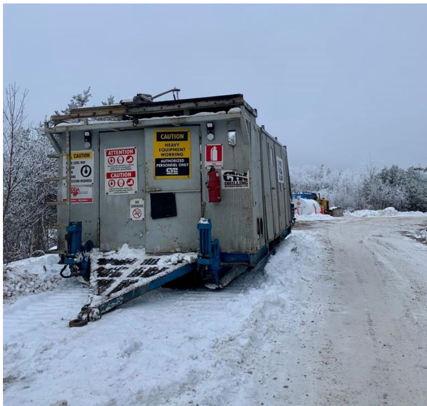
Figure 2 – Contractor Drill Rig 1 operating at Mavis Lake (top) Contractor Drill Rig 2 – deployed to Mavis Lake (bottom)