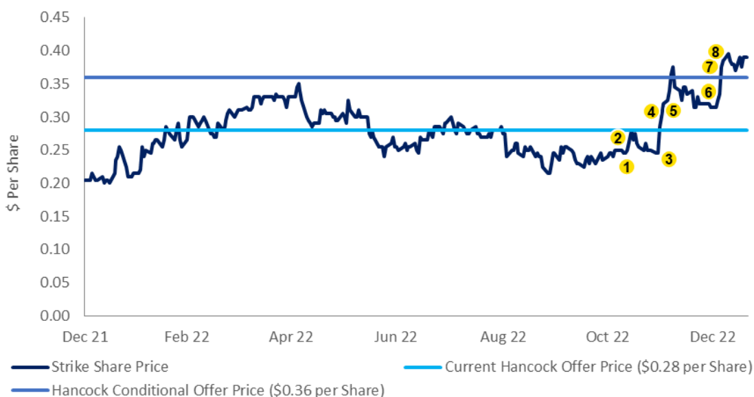
Figure 1.1 – Strike Share Price from 31 December 2021 to 20 January 2023

As the Strike Offer is a scrip offer, the implied value of the Offer will depend on the price of the Strike Shares at any particular time. Based on the closing price of Strike Shares on 20 January 2023, being the last full day of trading before the date of this Target's Statement, the implied value of the Strike Offer was $0.39 per Warrego Share, which is higher than both the Hancock Offer Price of $0.28 per Share and the Hancock Conditional Offer Price of $0.36 per Share. However, the Strike Share price has varied considerably over the last 12 months, as shown in the graph below: