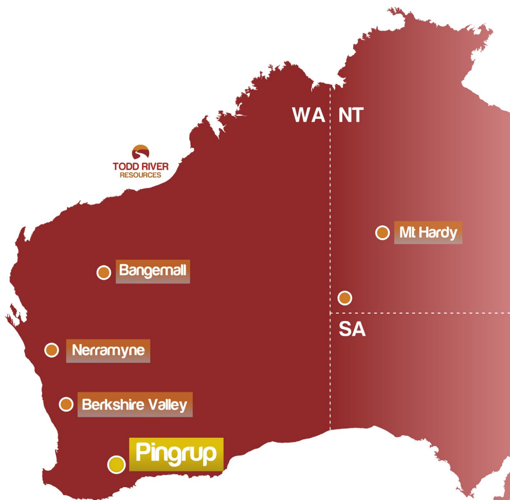
Figure 1 – Todd River Resources Projects highlighting the location of the Pingrup Ni-Cu-PGE Project

Enquiries: Will Dix + 61 (0) 8 6166 0255