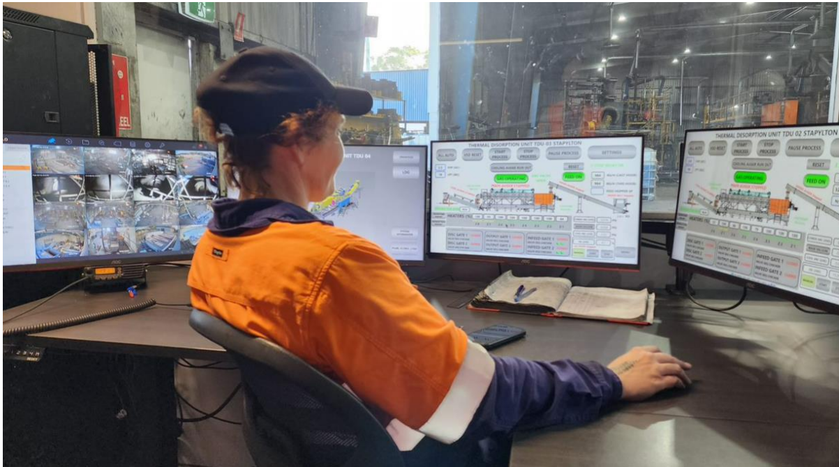
Image 7: Control Room Operations at Stapylton, QLD

All key assets, including our new infrastructure, have been connected to a centralised control room to enable to continuous real time monitoring of our unique patented process.