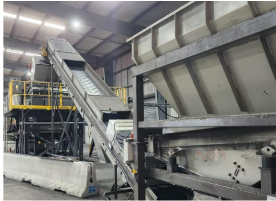
Image 1 and 2: Rasper Installation on site at Stapylton