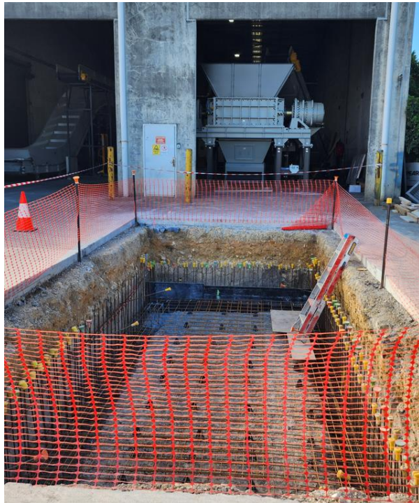
Shredding System being installed