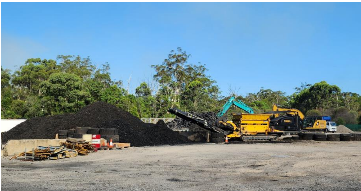
Image 8: Tyre collection and receivals yard at Stapylton, QLD

We have made significant progress with yard infrastructure to facilitate the streamlined processing of tyres by reducing our stockpiles to be "best in class" with regulators as we work towards completion of our 'just-in-time' operations.