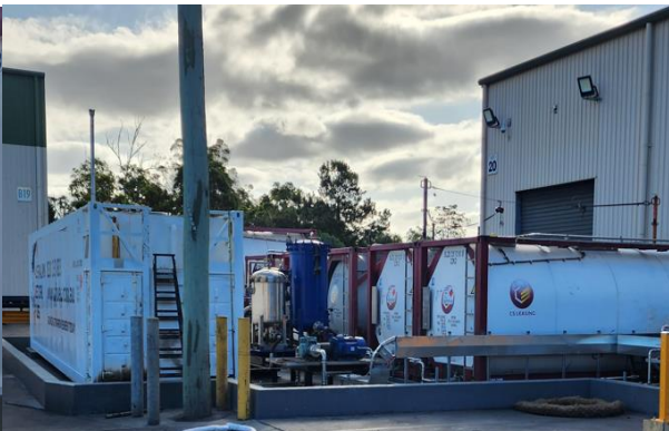
Image 3 and 4: Fuel management system installation on site at Stapylton: Source Company