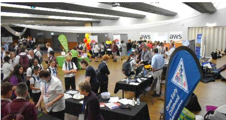
Aspire Careers Day, Dubbo.