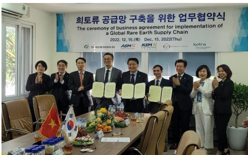
MOU signing ceremony with Chungcheongbuk Province & VTRE

In December, ASM signed a non-binding business agreement with the Chungcheongbuk Province in Korea and the Vietnam Rare Earth Company (VTRE) to co-operate to build a global rare earths supply chain 10 . Among the desired outcomes from the agreement is certainty of supply for KMP feedstock until the Dubbo Project commences operation.