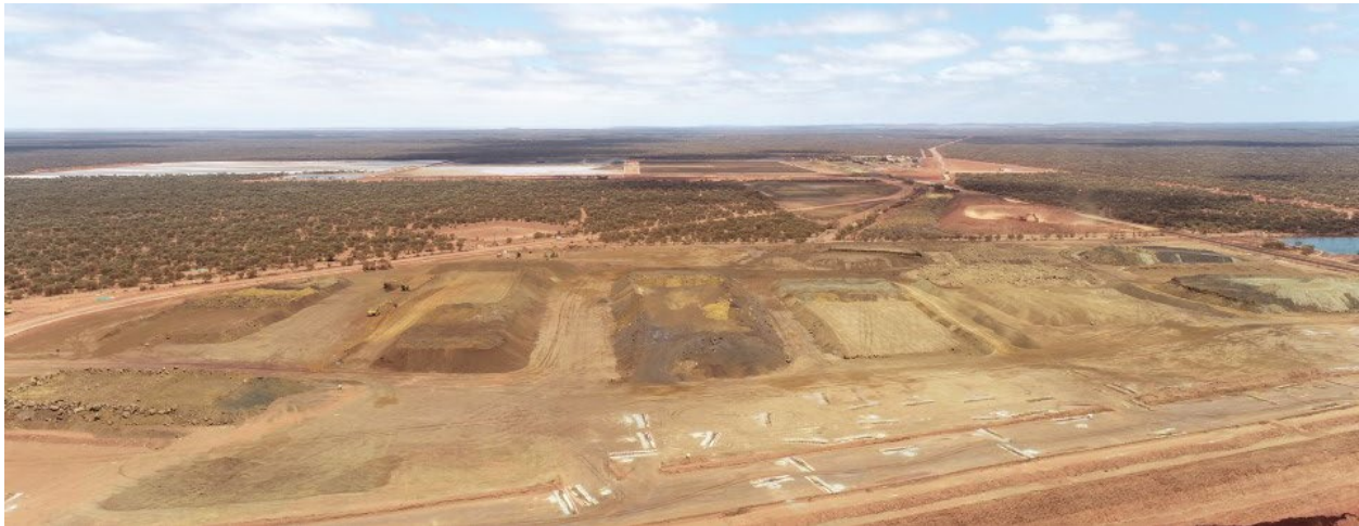
Aerial Photo: Run of mine stockpiles with Campaign 4-1 ores

Building the lanthanide concentrate stockpile in Mt Weld for the Kalgoorlie Rare Earth Processing Facility is on schedule as Mt Weld manages both the increasing demand from Lynas Malaysia and inventory build for the Kalgoorlie start up.