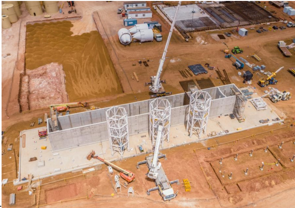
MgO Tanks. Outer walls complete, two inner walls completed, silo structures installed. Excavation for load in system and Chemicals warehouse in the rear.