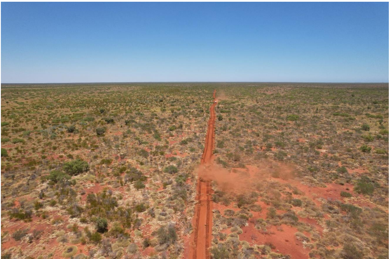
Figure 1: Refurbished fenceline track between the Eastern and Western EM anomaly drill targets