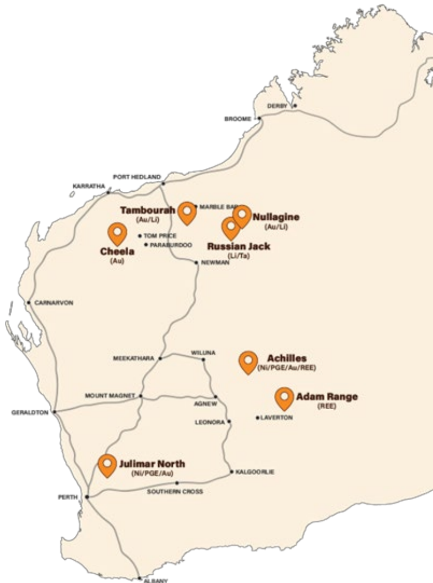
Figure 2. Tambourah Metals Projects - Location Map

Tambourah Metals Ltd (ASX: TMB) is a Western Australian focused exploration company, with the primary objective of the rapid exploration and development of critical minerals and gold projects. TMB has three Lithium Projects in the Pilbara Region – Russian Jack, Tambourah Lithium and Nullagine Lithium; three gold projects in the Pilbara Region – Tambourah, Cheela and Nullagine; Ni-PGE-Cu-Au projects at Julimar North. In the NE Goldfields exploration for Ni-PGE-Cu and REE at Achilles Project including REE at Adam Range.