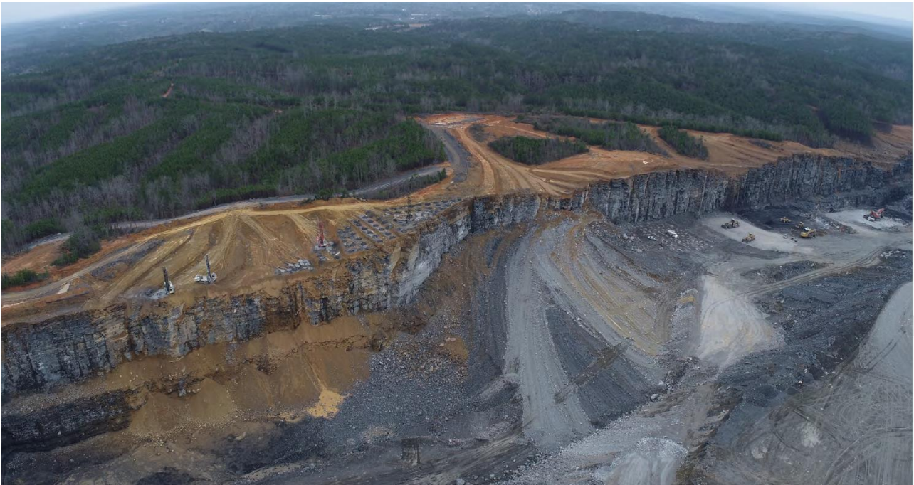
Image: Black Warrior Mine: new drills on top bench; D11T dozer push paths; benching to Newcastle seam; then to Mary Lee seam