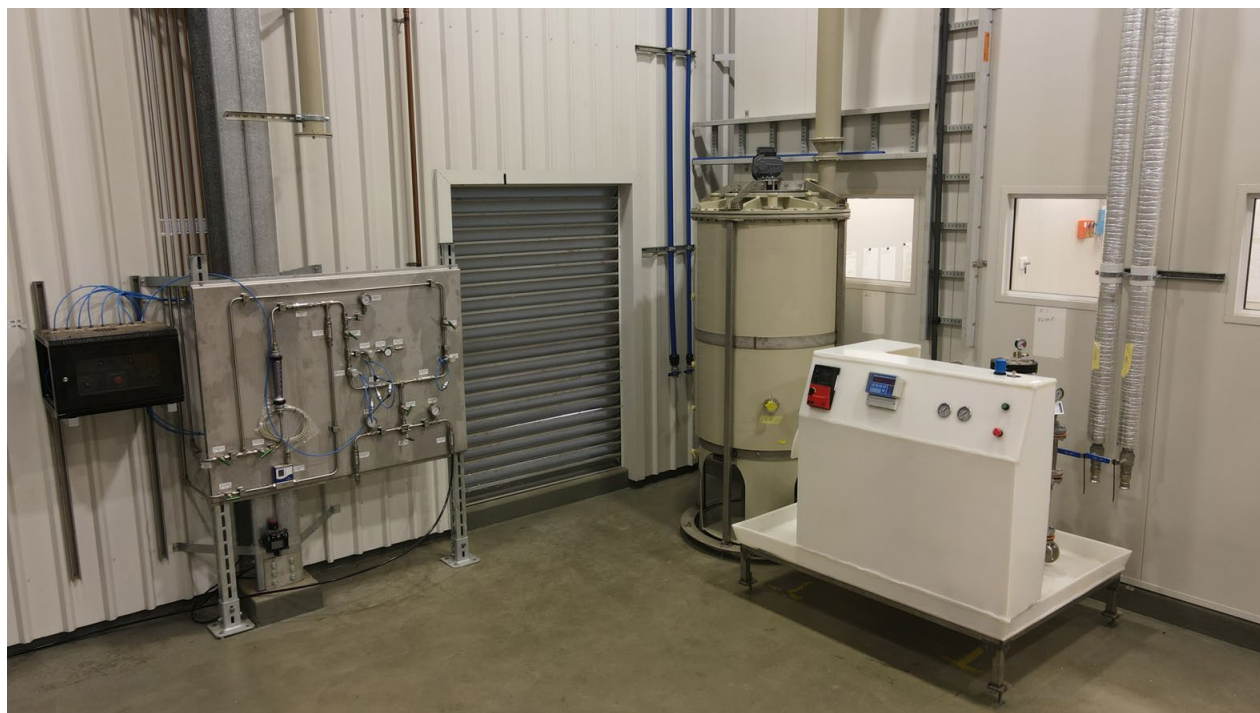
Figure: Control and safety systems being installed and commissioned