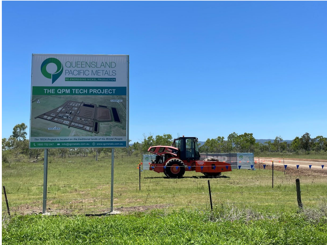
Figure: QPM site at Lansdown