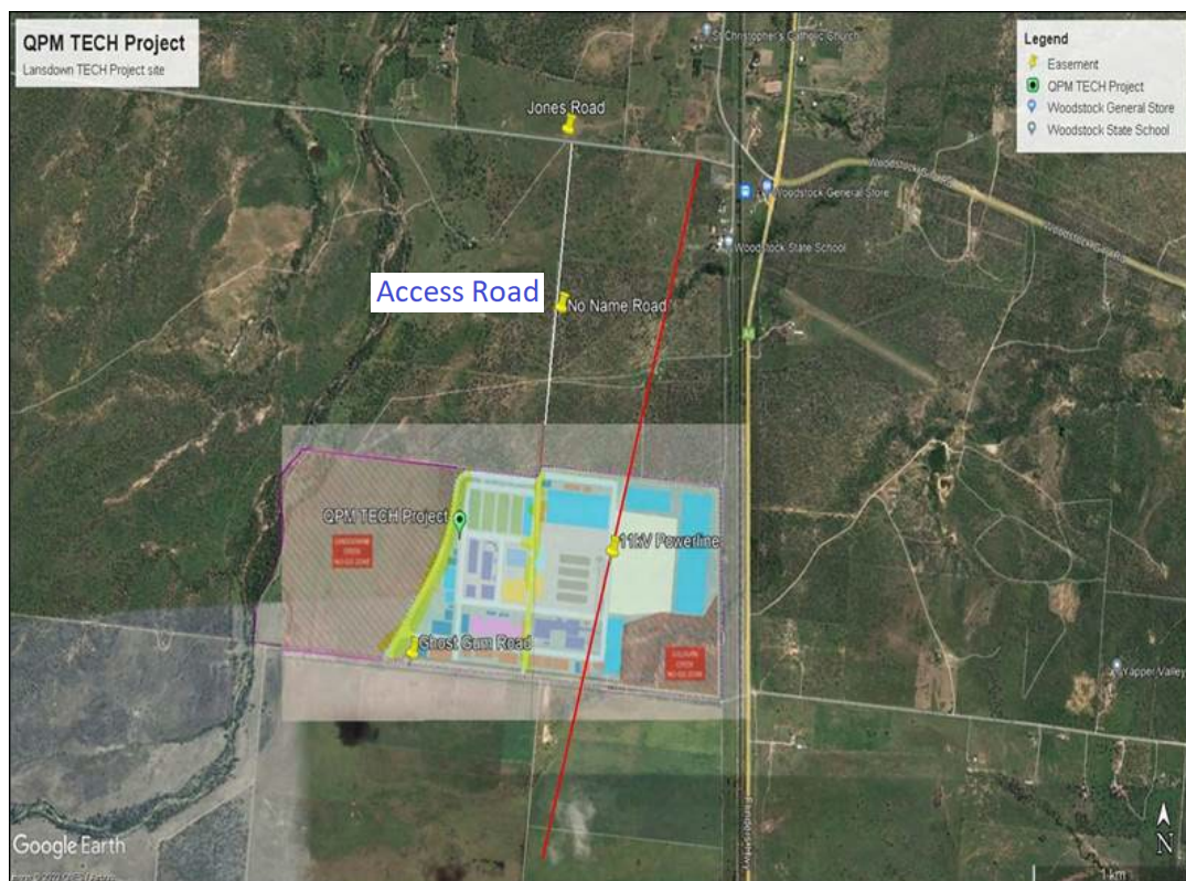
Figure: Map of QPM site

Completion of this access road will facilitate QPM’s ability to commence preliminary site establishment works, of which planning is underway.