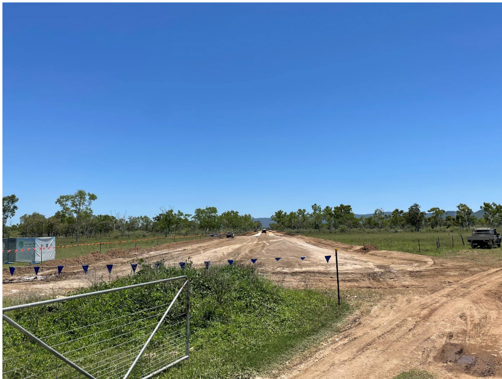
Figure: View looking north towards Jones Rd from QPM northern boundary – access road construction