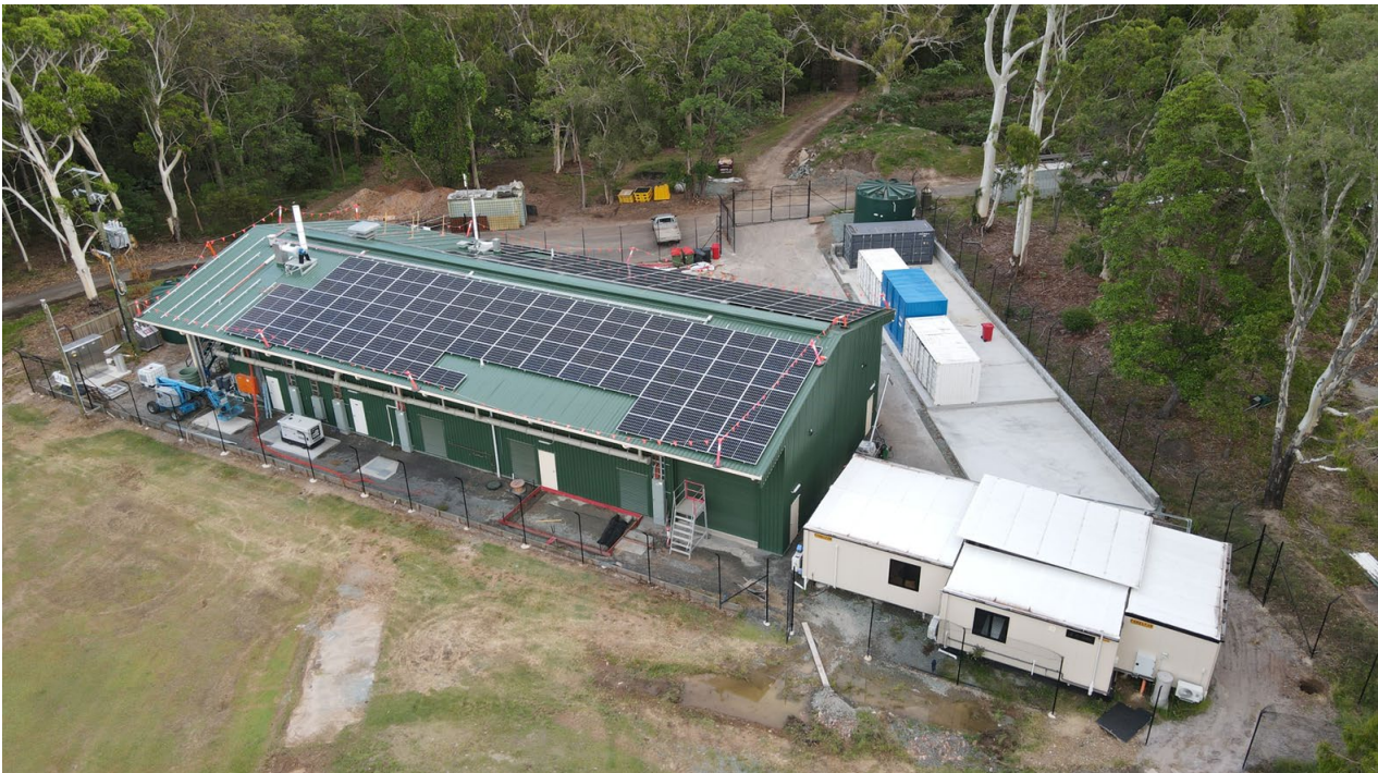
Figure: Lava Blue Centre for Predictive Research into Speciality Materials (location of demonstration plant)

During the quarter, work continued on the construction of the HPA demonstration plant by Lava Blue, located at its Centre for Predictive Research into Speciality Materials. Unfortunately there has been some delays in finalisation of this plant and commissioning and operation is now targeted for late Q1 and into Q2 of the 2023 calendar year.