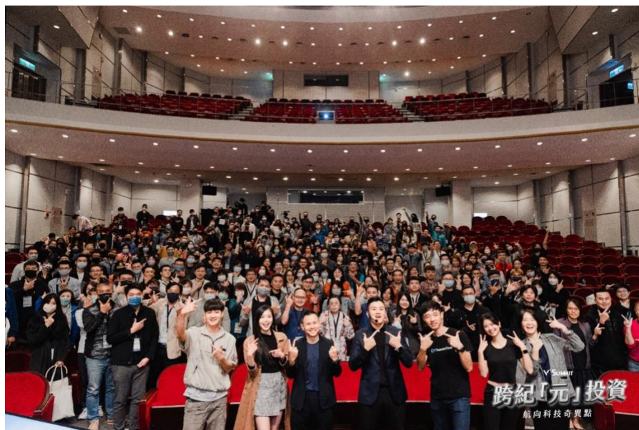
Figure 1. Taiwan's inaugural VI Summit