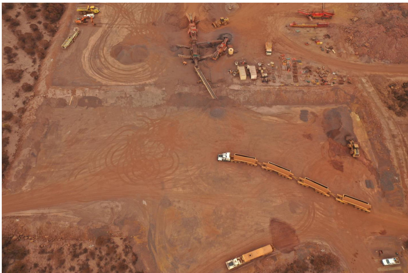
Figure 1 - JWD product pad overview