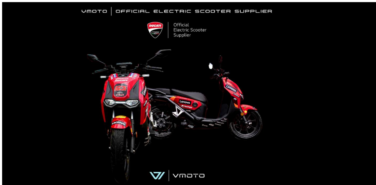
Photo: Vmoto is the official electric scooter supplier of Ducati and Team Ducati Corse of MotoGP