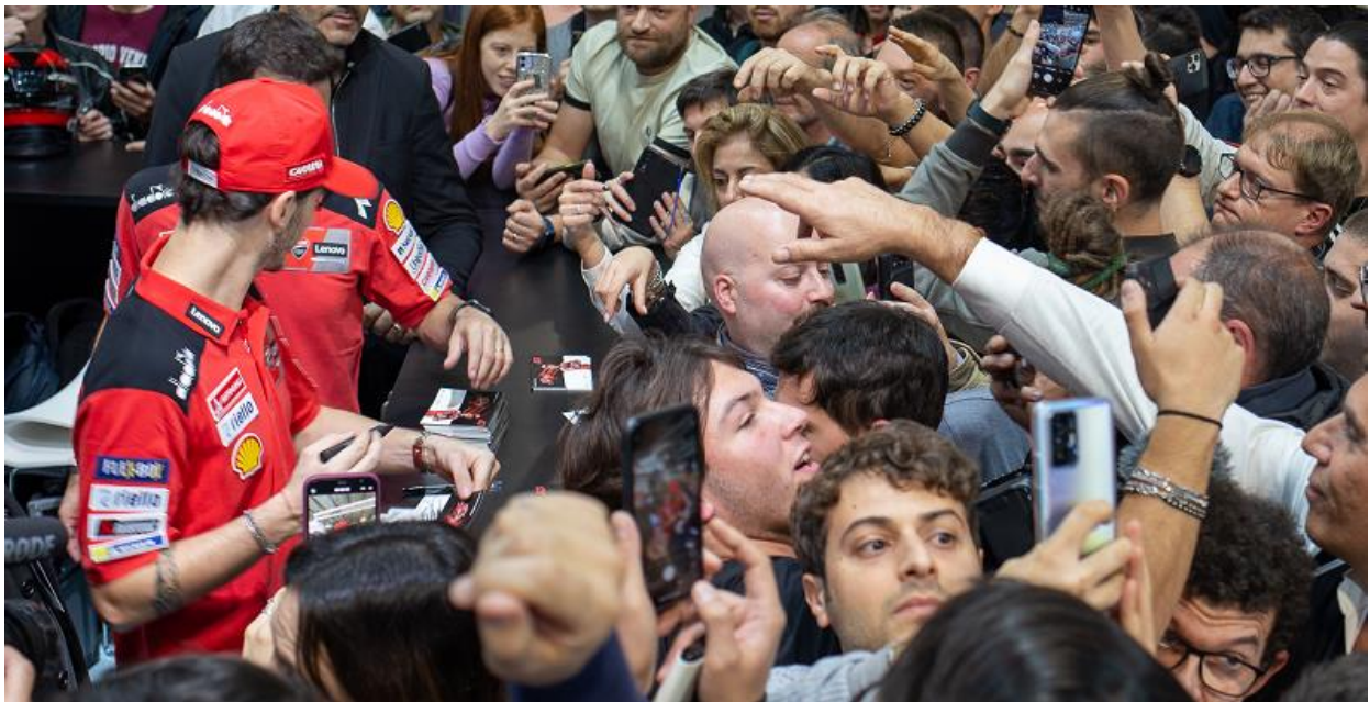
Photos: Michele Pirro and Francesco Bagnaia attending and promoting Vmoto at EICMA 2022.

Vmoto Limited Suite 5, 62 Ord Street, West Perth, Western Australia 6005, Australia