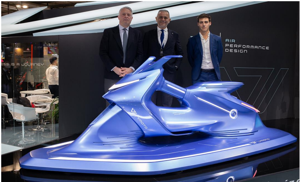
Photo: Pininfarina and Vmoto launch new "Air Performance Design" concept at EICMA 2022.

Pininfarina S.p.A. is an Italian car design firm and coachbuilder, with headquarters in Cambiano, Turin, Italy. The company was founded by Battista "Pinin" Farina in 1930.