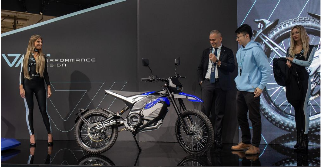
Photo: Vmoto launch new electric dirt bikes at EICMA 2022

Extensive market research was undertaken during the design phase and the Company is confident of the success of the dirt bike range from commencement of commercial availability estimated in 2Q23.