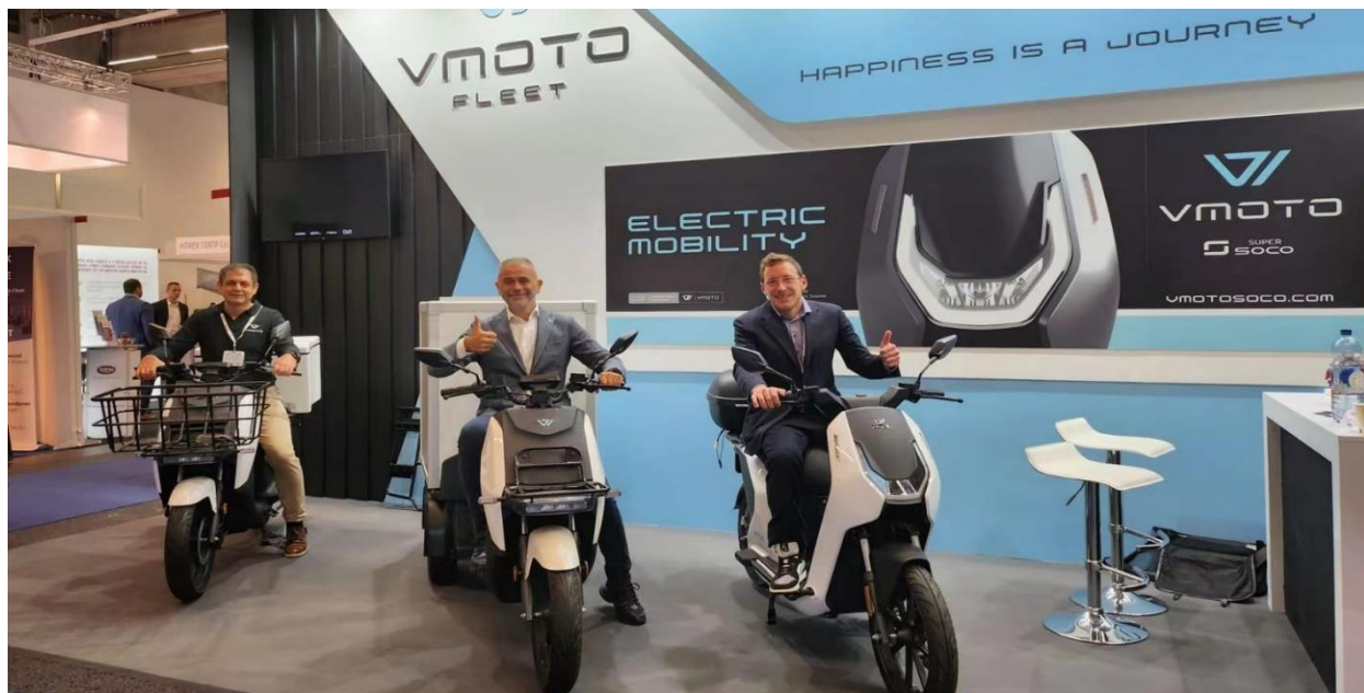
Photo: Vmoto exhibition at the Parcel+Post Expo 2022 held in Frankfurt, Germany on 18-20 October 2022

During October 2022, Vmoto exhibited and participated in the Parcel+Post Expo 2022 held in Frankfurt, Germany. The Parcel+Post Expo is a leading global event for the world's parcel delivery, e-commerce logistics, and postal industries attracting an audience of 4,000+ industry leaders and decision makers from 100 countries. Vmoto received several enquiries from the attendees with significant interests being expressed for the Company's B2B range of products and its comprehensive B2B delivery solutions.