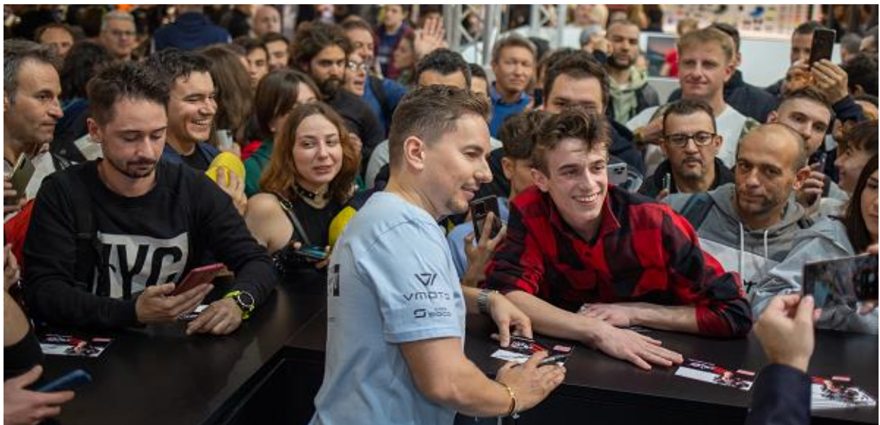
Photo: Jorge Lorenzo, 5 times MotoGP World champion, supporting and promoting Vmoto at EICMA 2022

Vmoto Limited Suite 5, 62 Ord Street, West Perth, Western Australia 6005, Australia