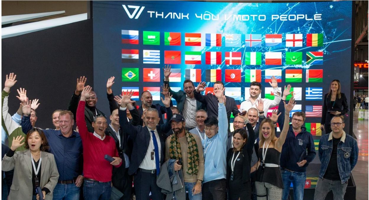
Photo: Vmoto team, distributors, and partners from around the world at EICMA 2022

An estimated 18,000 attendees visited the Vmoto exhibition at EICMA 2022 with journalists, professionals, and the general public displaying significant interest in the Company's designs and products. The Company would like to thank the Vmoto team, distributors, and partners who organised and attended this important marketing event, resulting in the generation of numerous sales leads.