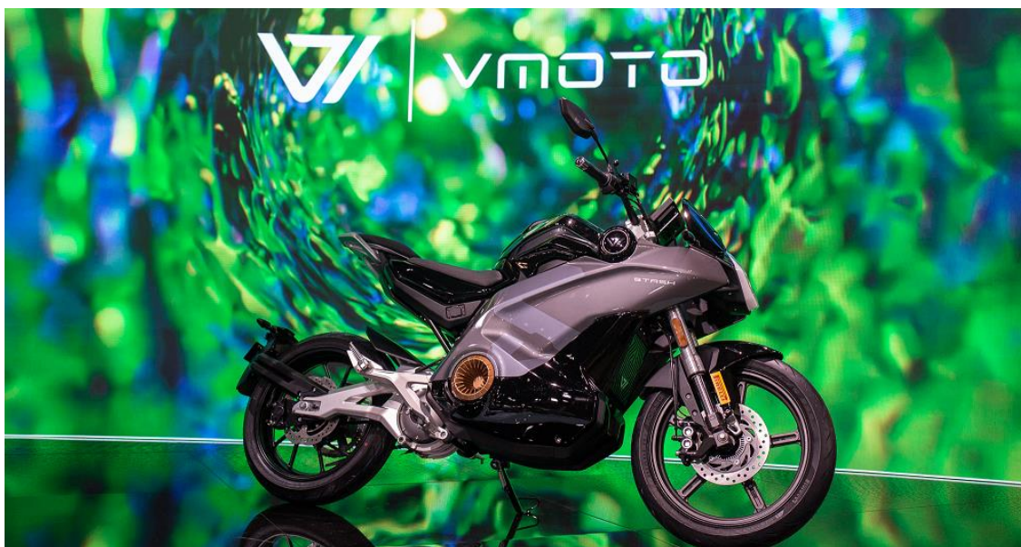
Photo: Vmoto’s Stash model exhibited in EICMA 2022, held in Milan, Italy on 7-11 November 2022

Total cash generated from ordinary operations has increased by A$9.4 million since the end of the last financial year, reflecting the continued strong and profitable performance of the business whilst providing the Company with the opportunity to pursue strategic growth initiatives to further consolidate its leading position in the electric motorcycle markets.