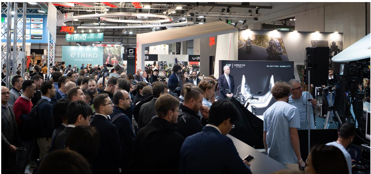
Photo: Crowds gather around Vmoto booth at EICMA 2022

Vmoto Limited Suite 5, 62 Ord Street, West Perth, Western Australia 6005, Australia