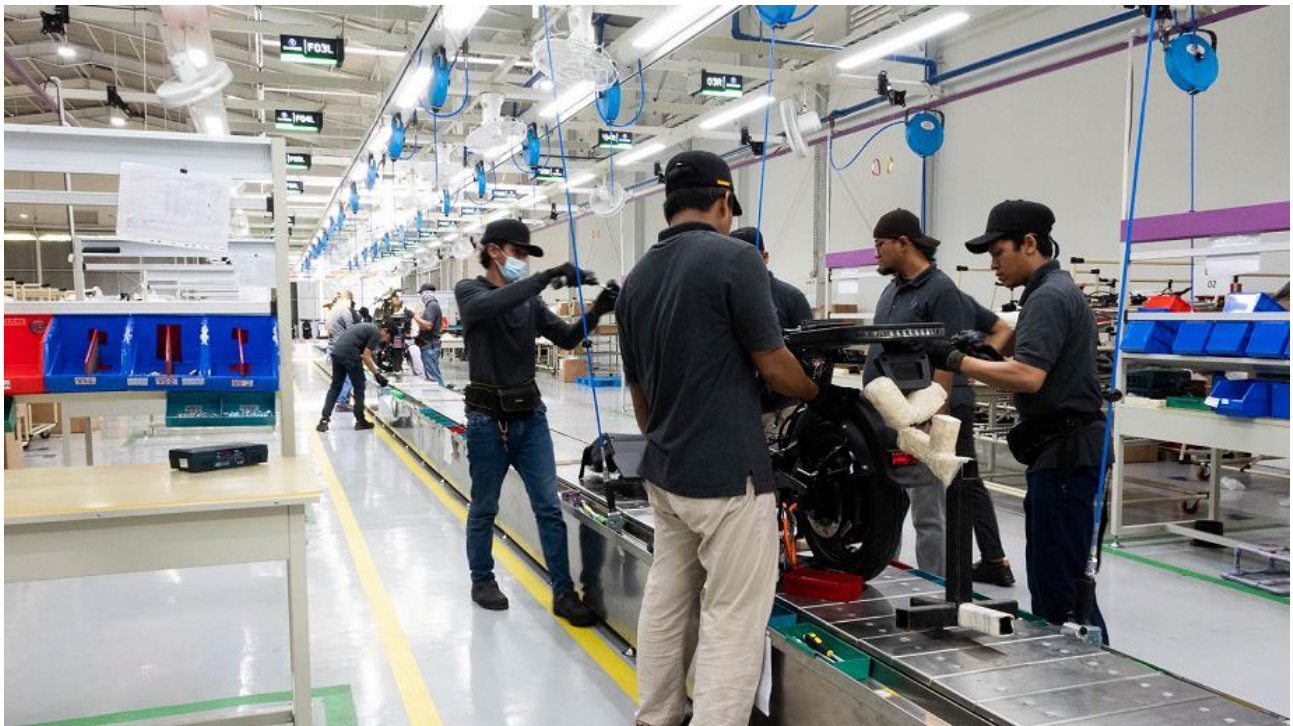
Photo: Charged Asia assemble and distribute Vmoto products in Indonesia

In addition, Vmoto will act as core technology partner of Charged Indonesia, providing all necessary technical assistance to Charged Indonesia in relation to electric motorcycles products.