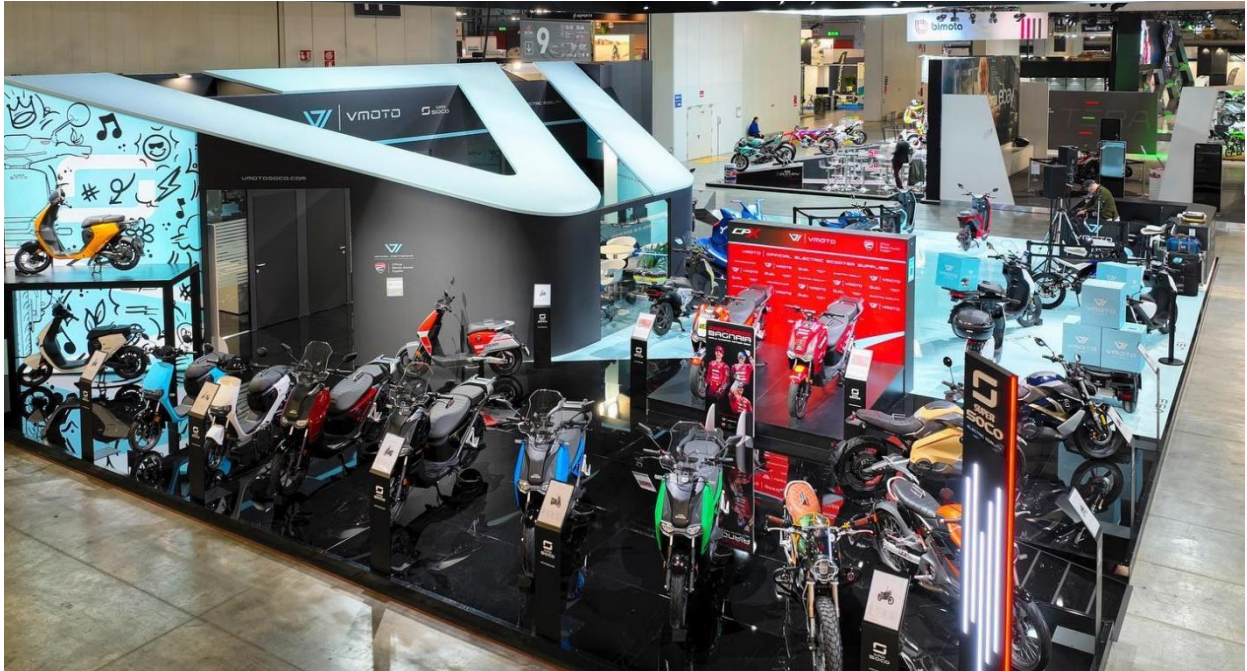
Photo: Vmoto exhibit at EICMA 2022

During November 2022, Vmoto exhibited and launched its new products and introduced a new futuristic concept "Air Performance Design" in cooperation with Pininfarina at the Esposizione Internazionale Ciclo Motociclo e Accessori 2022 ("EICMA 2022") motorcycle expo held in Milan, Italy. 130 exhibitors from around the world promoted their brands to the 473,000+ attendees with Vmoto receiving significant interest in its latest designs.