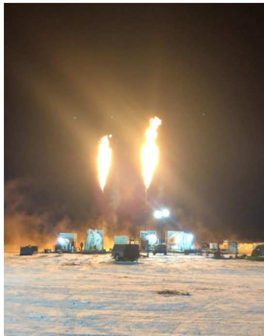
Calima #2 and #3 being flared

Both wells are undergoing extended well tests ("EWT") to determine flow rates from the Middle & Upper Montney.