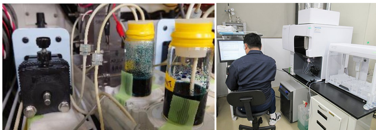
Figure 2: Mini-cell testing of TMT vanadium electrolyte – LE System's Tsukuba Technical Centre, in Ibaraki, Japan.

The Company's vanadium electrolyte demonstrated very positive results from this initial testwork, including high power efficiency, and compares favourably to electrolyte produced from other vanadium feedstock. In particular, analysis of the electrolyte confirmed that it meets the quality specifications of major VRFB manufacturers.