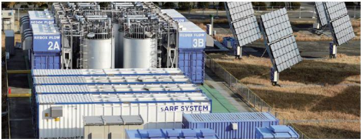
Figure 3. The Yokohama Works VRFB designed and installed by Sumitomo Electric.

The Company is also proposing to develop a pilot plant for the production of vanadium electrolyte to demonstrate process viability and commercial samples for potential customers. The focus of the pilot plant will be to leach and refine ore extracted from the MTMP under controlled conditions to produce high purity vanadium electrolyte, demonstrating the full ore to electrolyte production viability. TMT is engaging with its Tier One partners to assist with the pilot plant.