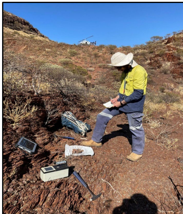
Figure 2. Collection of rock chip samples at the Ashburton Project.