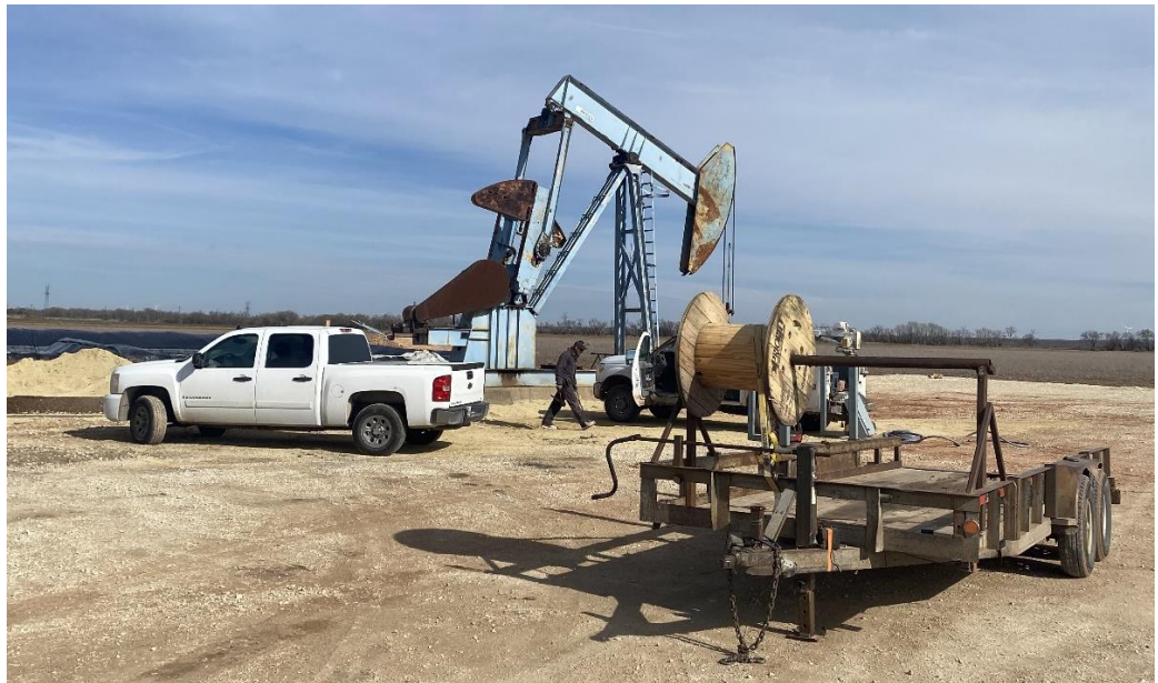
JVU#6 Beam Pump

Winchester Energy Limited (ASX: WEL) ("Winchester" or "the Company") is pleased to provide an update on its field activities at the Varn Oil Field in Nolan County, Texas.