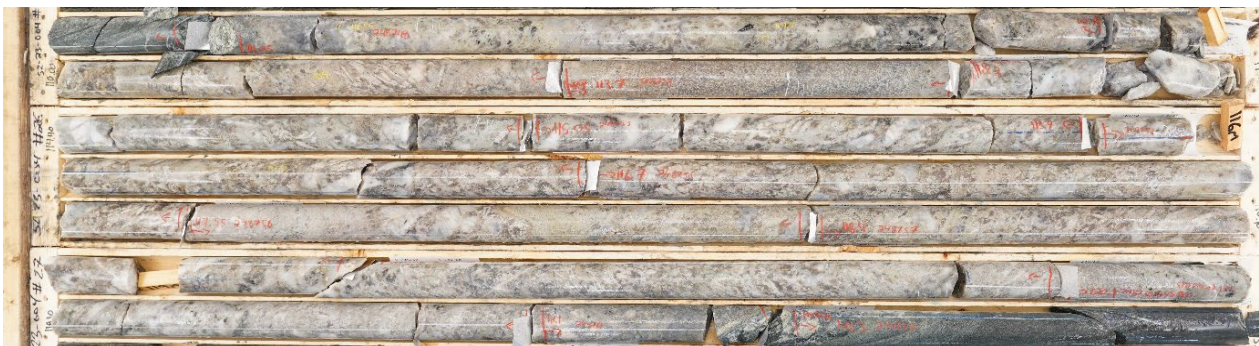
Figure 1 – SZ23-004 core with fine to large white spodumene laths from 111.85m to 121.3m